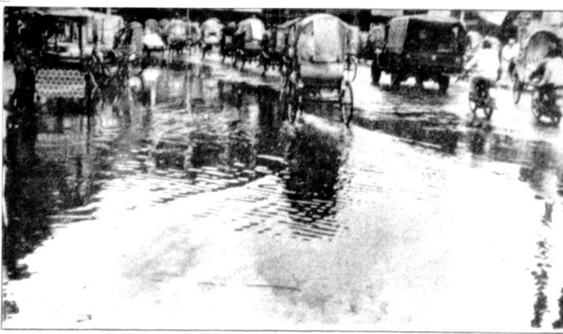
SYLHET: Most areas of Hasan Market at the town go under water after a slight rainfall due to improper drainage system.

Local Islamic Foundation also chalked out week-long programme at the town.