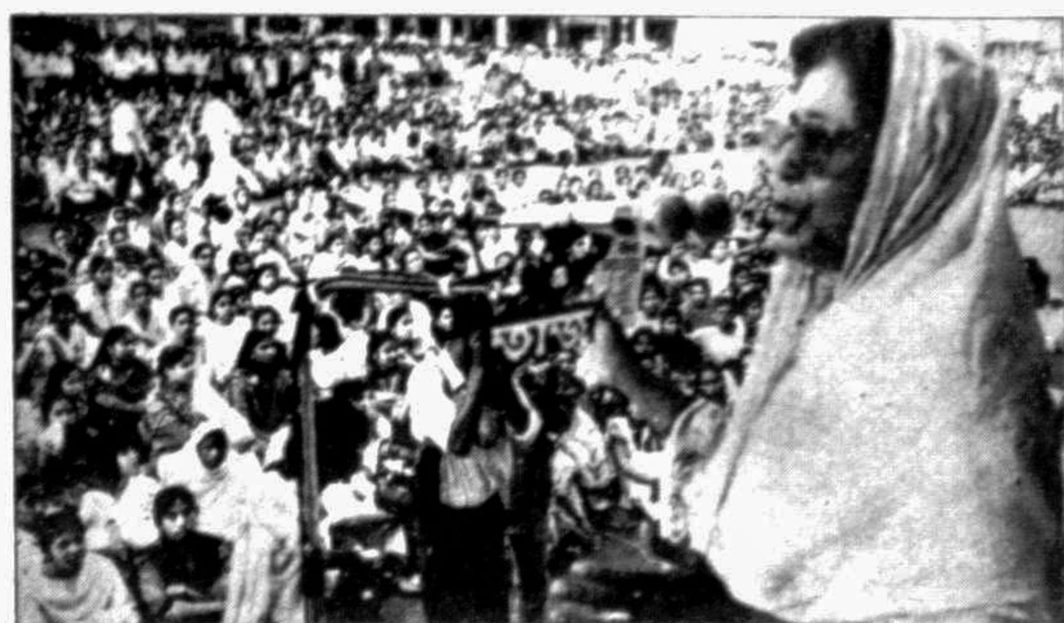
Jahanara Imam addressing a rally of Nirmul Body women's wing in front of National Press Club yesterday. Story on page 1