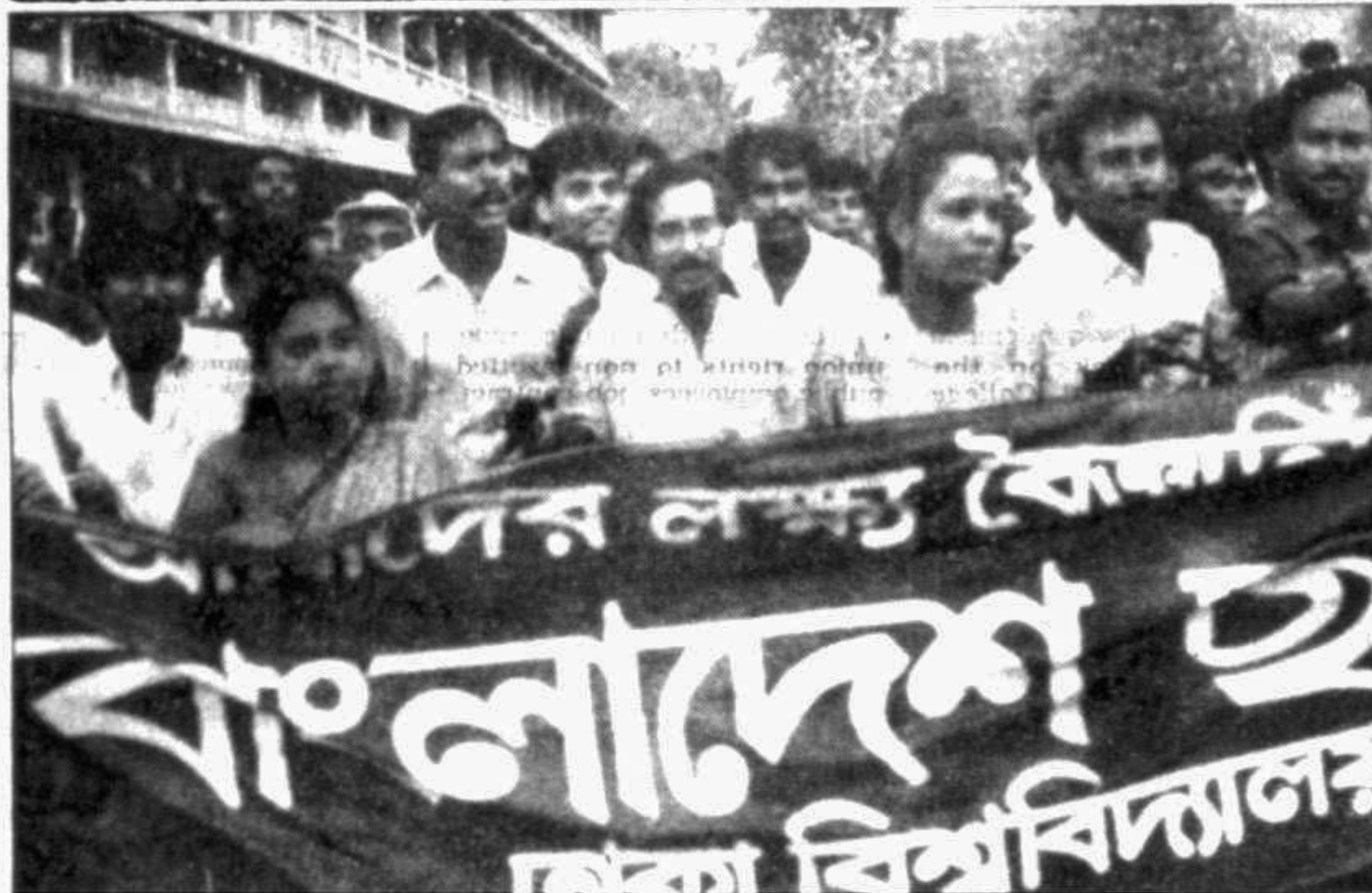
DU unit of JSD (Inu) backed Bangladesh Chhatra League brought out a procession in the city yesterday following its central council.

There is a certain trepidation, understandably, as the snakes move around, but the faith in the control of the man over his snakes is total, and many a soul has gone away, humming the tune to himself, after a performance from the ever fascinating snake charmer.