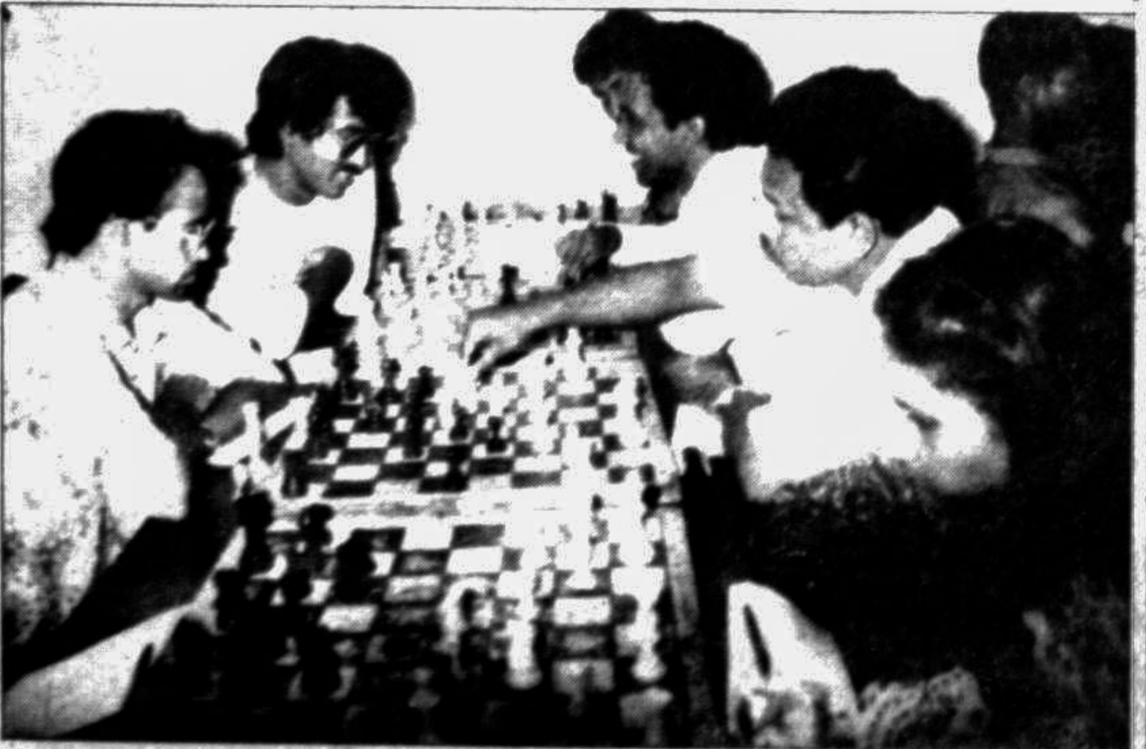
A scene from the fourth round matches of the qualifying tournament at the NSC chess room yesterday.

But Korea's team, protesting against a judge's decision to remove them from the final against Spain after a technical infringement of the rules in their semifinal, threw their bronze medals on the floor in disgust at the medal ceremony.