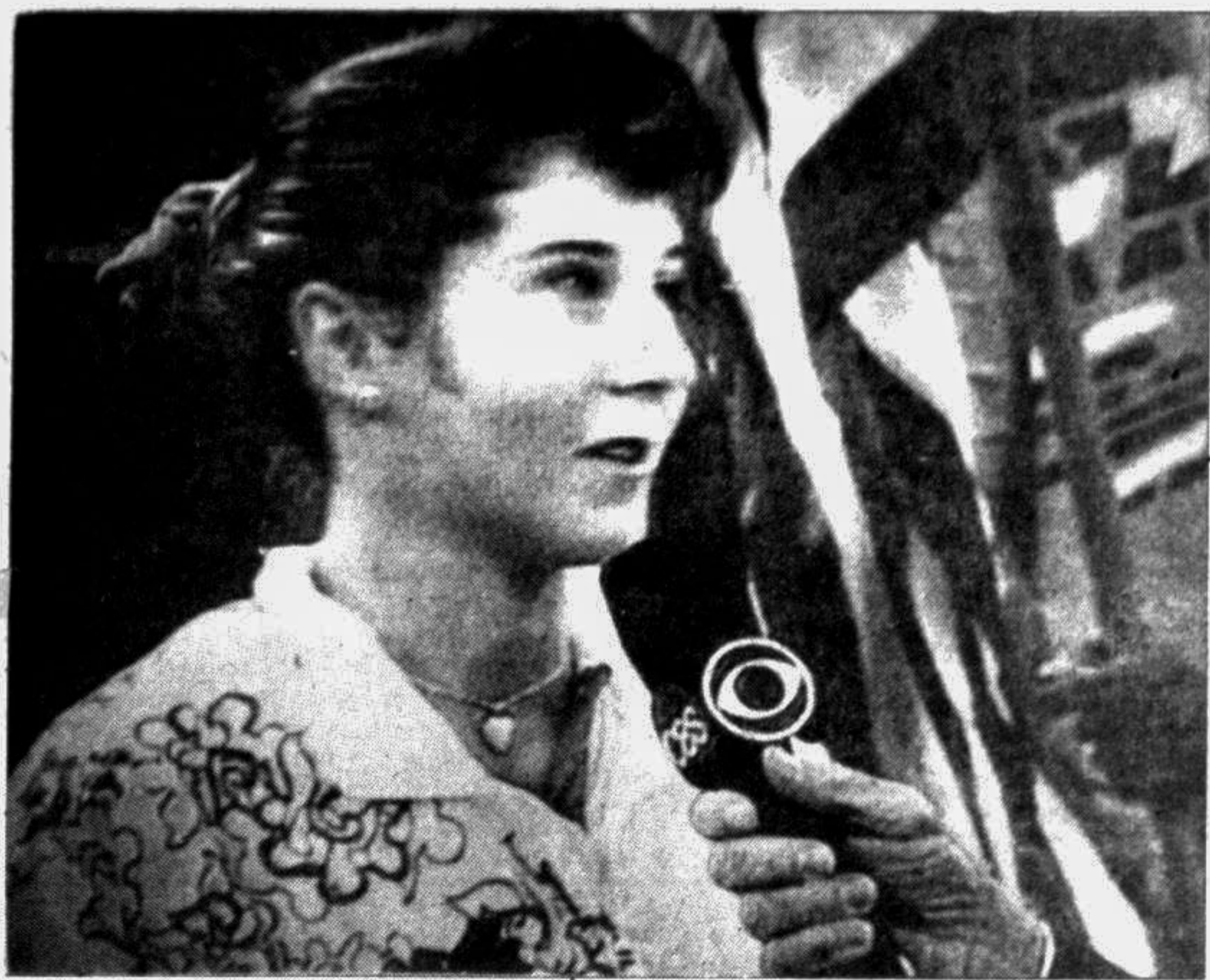
Monica Seles of Yugoslavia talks to newsmen after retaining the women's singles crown of the US Open on Saturday at the National Tennis Centre, New York.