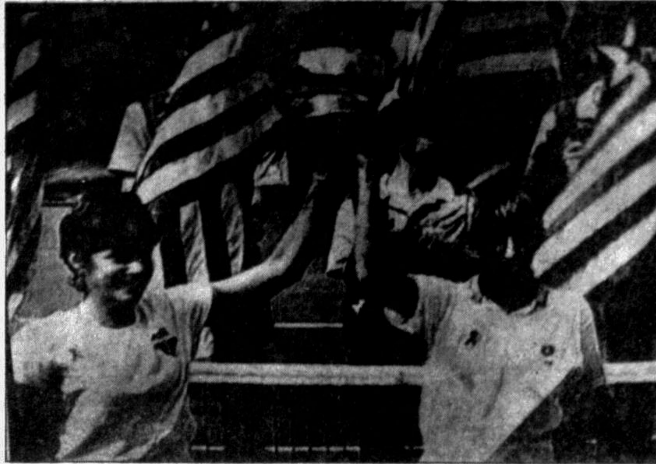
Natalia Zvereva of the CIS and Gigi Fernandez of the United States hold aloft their women's doubles trophy at the US Open after Sunday's final.