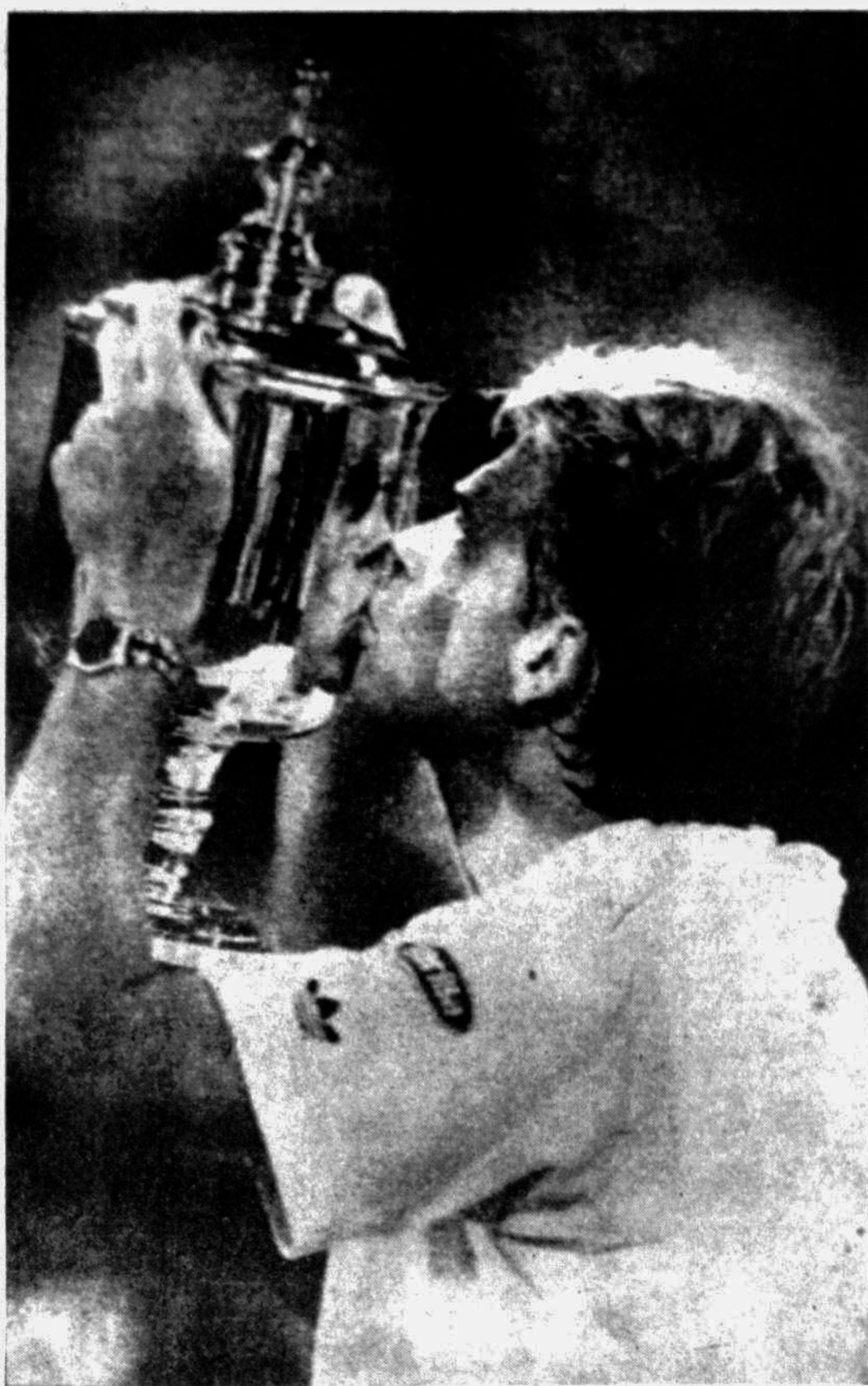
Stefan Edberg of Sweden kisses the much coveted US Open trophy after retaining the singles title defeating American Pete Sampras in the final on Sunday at Flushing Meadow, New York. The victory also gave Edberg the number one spot on the ATP computer, ahead of deposed world number one Jim Courier of the United States.