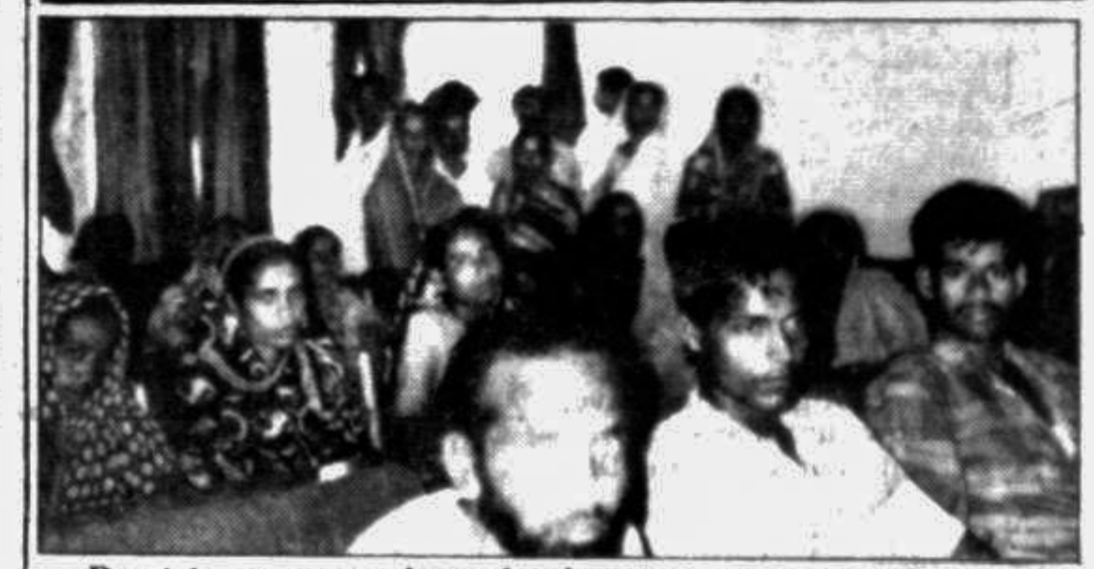
Participants at a three-day-long course on health care organised by the ETDA. In all 200 male and 50 female participated at the training course concluded on September 7.

From Our Correspondent KHAGRACHHARI, Sept 14: The primary-education in eight thanes of the district has seriously been hampered as the schools damaged by various cyclones have not yet been reconstructed. Official sources said that 257 primary schools of the district which were totally or partially damaged by the devastating cyclone of April 1991 have not yet been reconstructed or renovated. The source further said that 121 primary schools were totally damaged and 136 schools partially damaged by April '91 cyclone. Seventy per cent primary schools of the district need immediate reconstruction and renovation, an official of the district Primary Education Department said adding that falling which the primary education in the district will come to halt in the near future. The Engineering Bureau of the Local Government Council and the Facilities Department of the Education Ministry have jointly undertaken a plan to reconstruct and renovate 50 primary schools at a cost of taka two crore, the official said. The progress of the work is far from satisfactory due to poor allocation of the fund and other complications.