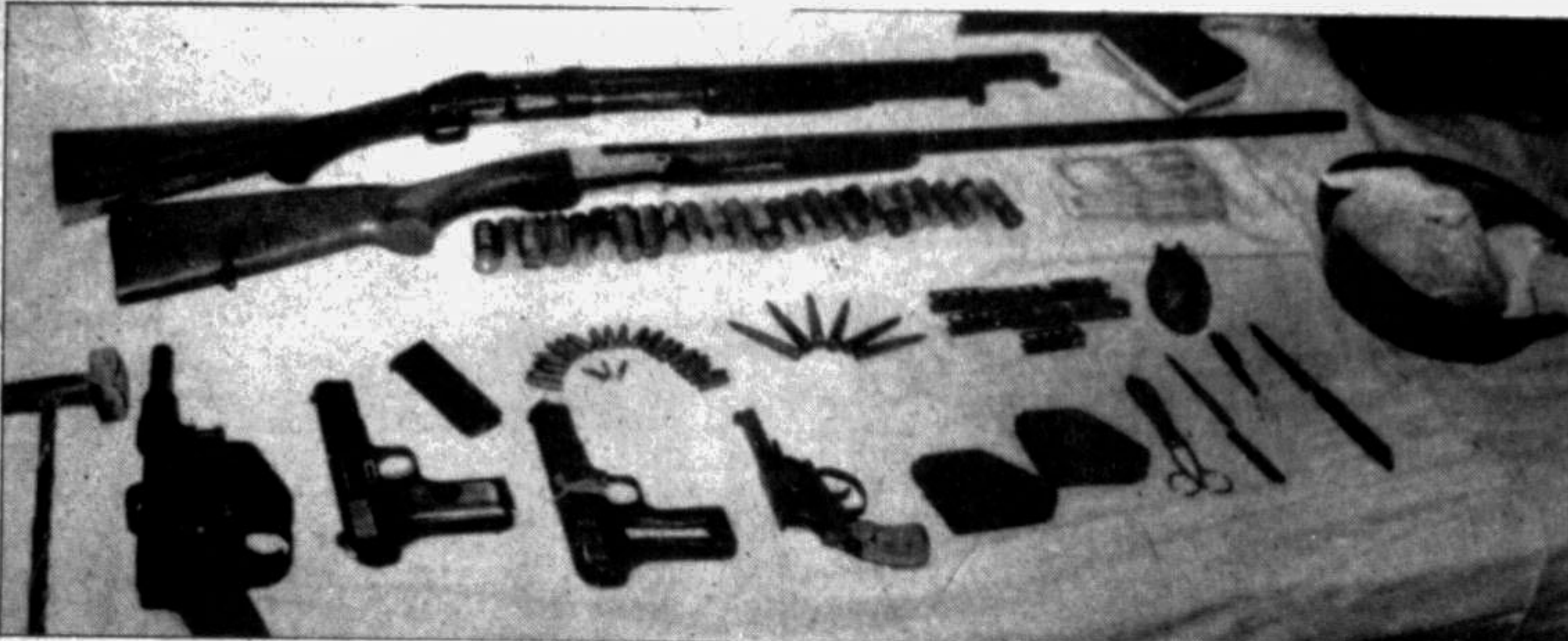
Cache of arms recovered from Freedom Party head office last night. More picture on Back Page.

The recovered arms, ammunition and other articles were brought to the Dhaka Metropolitan Police (DMI) control room, according to police.