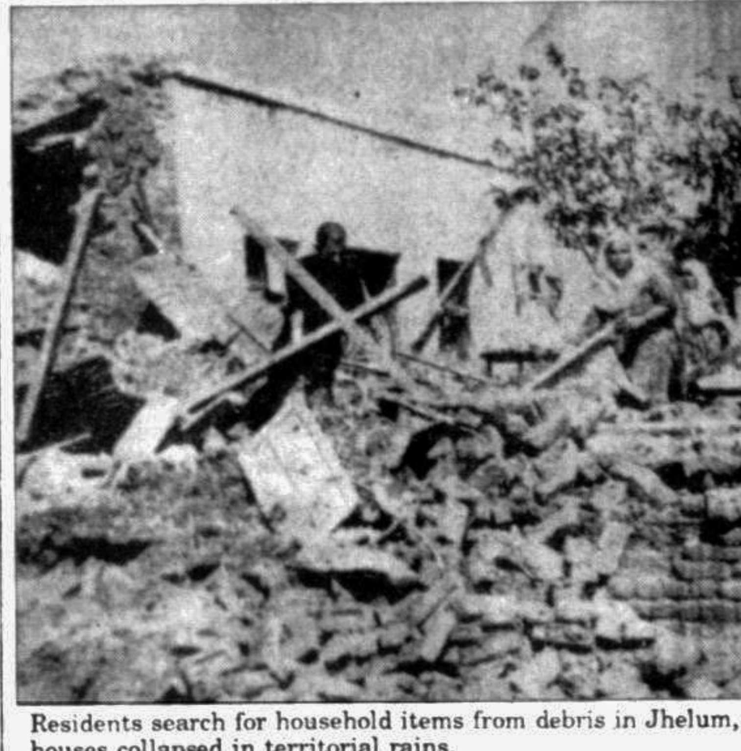
Residents search for household items from debris in Jhelum, Pakistan, yesterday after their houses collapsed in territorial rains.

The Second Conference on Children in SAARC countries will be held September 16-18 in Colombo for policy planning to ensure welfare of teeming babies in the region, reports UNB. Social Welfare and Women's Affairs Minister Tariqul Islam will lead a 27-member Bangladesh delegation to the conference arranged jointly by the Sri Lankan government and the UNICEF.