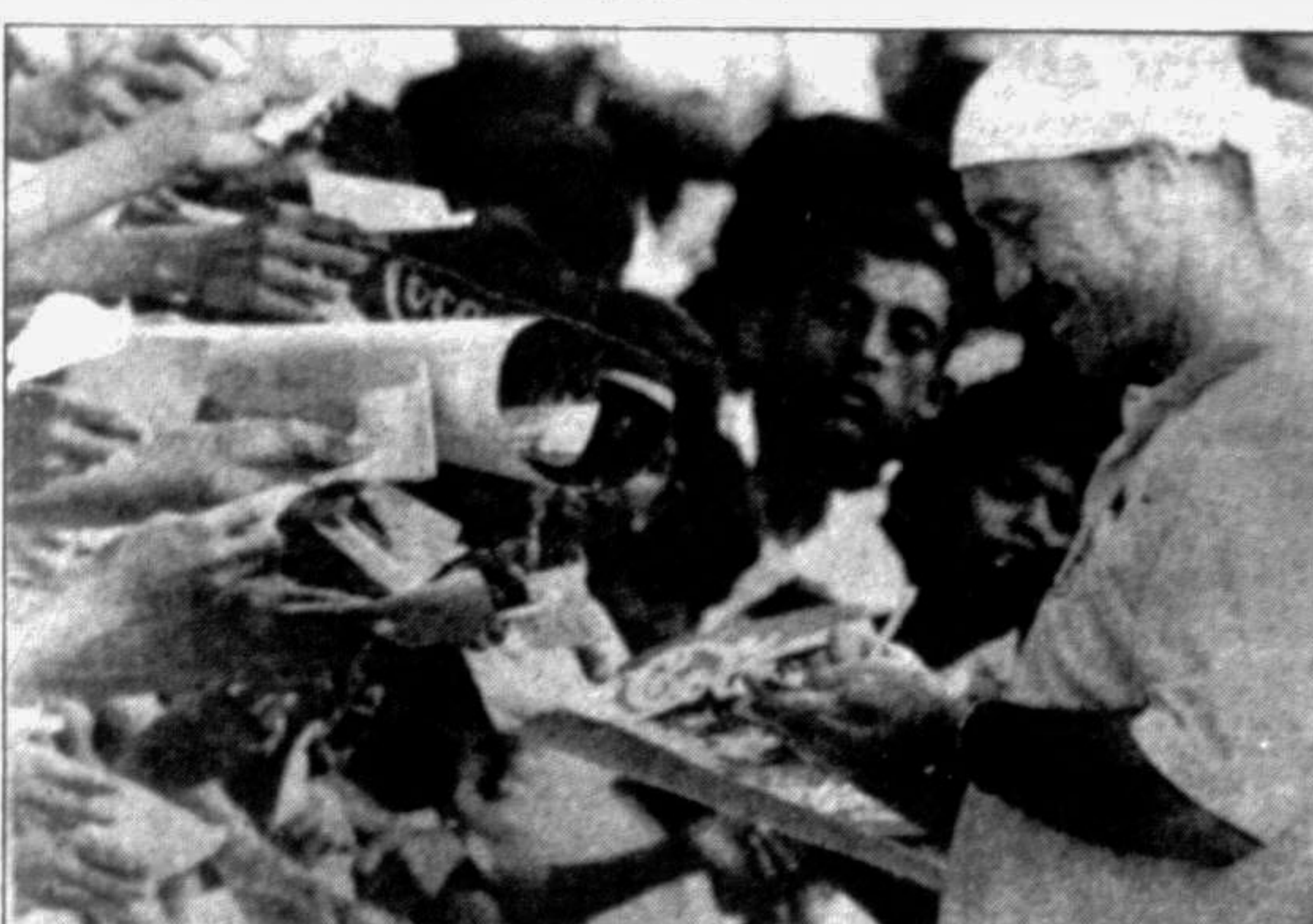
Australian all-rounder Greg Matthews obliges autograph hunters during the rain ruined morning session of the third day of the third and final Test between Sri Lanka and Australia at Moratuwa on Thursday.