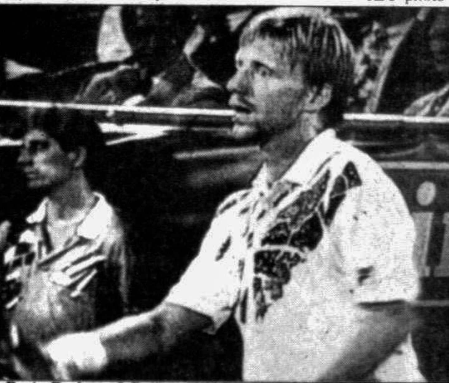
Boris Becker of Germany is infuriated by a controversial line-call in his epic fourth round US Open clash against Ivan Lendl on Tuesday.