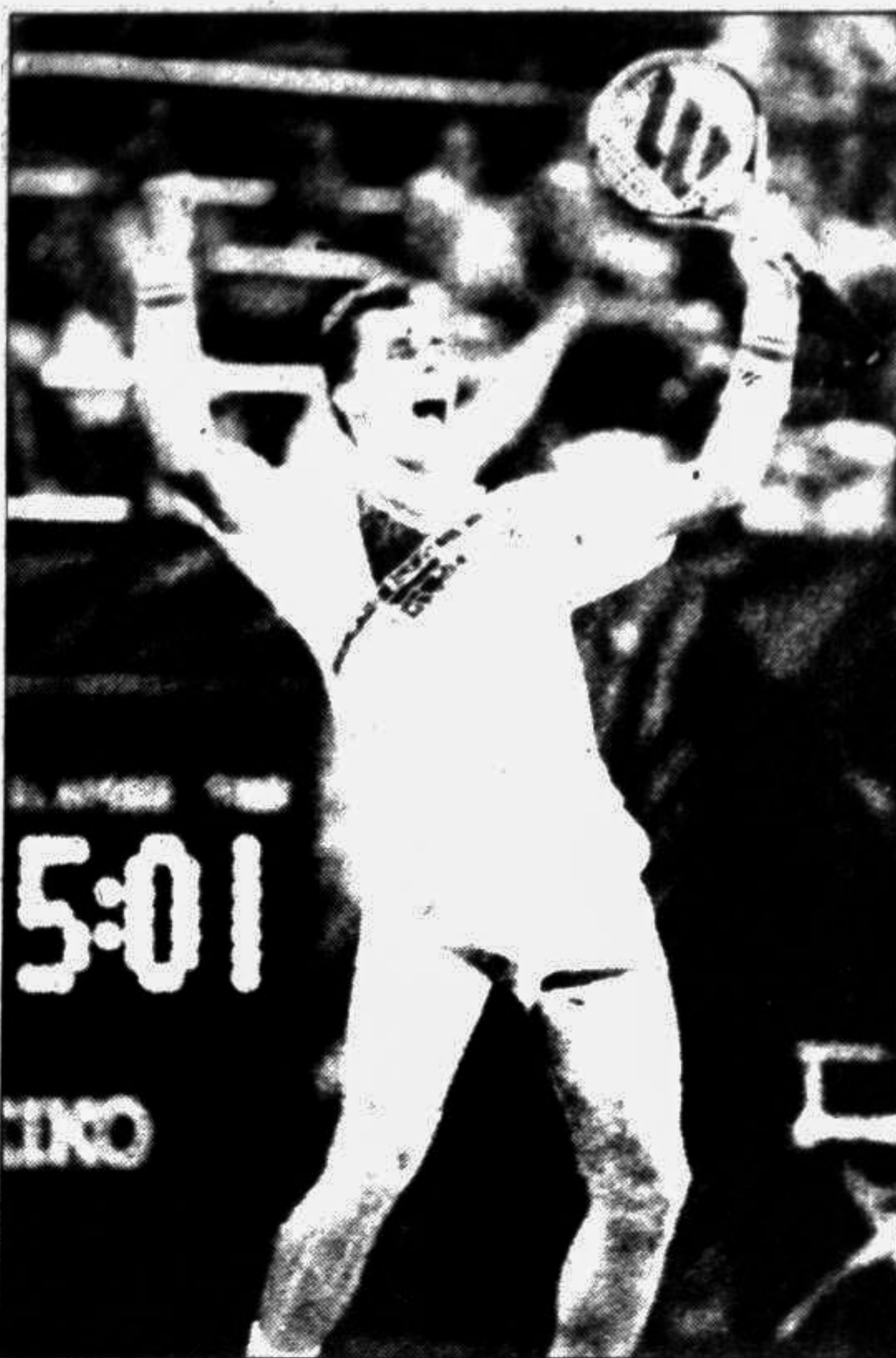
Ninth seed Ivan Lendl, the Czech-born American, yells as he wins match point during his five-hour and one minute marathon match against Boris Becker of Germany at Flushing Meadow on Tuesday. Lendl won 6-7, 6-2, 6-7, 6-3, 6-4.

"I had an advantage over him, because I have played enough Slams to know that what it takes to come through."