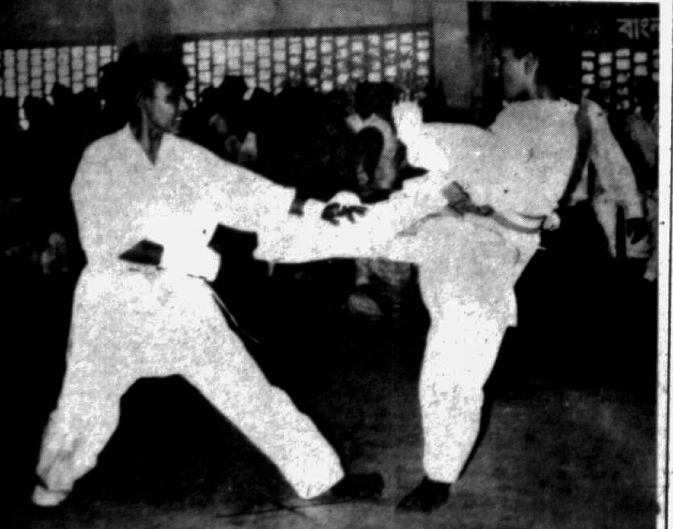
Action from yesterday's Sadharan Bima karate competition at the NSC gymnasium.

Jaime Oncins and Luiz Mattar of Brazil, Kaime Yzaga of Peru, Andres Gomez of Ecuador and Brayan Shelton of the United States were among the players due to take part.