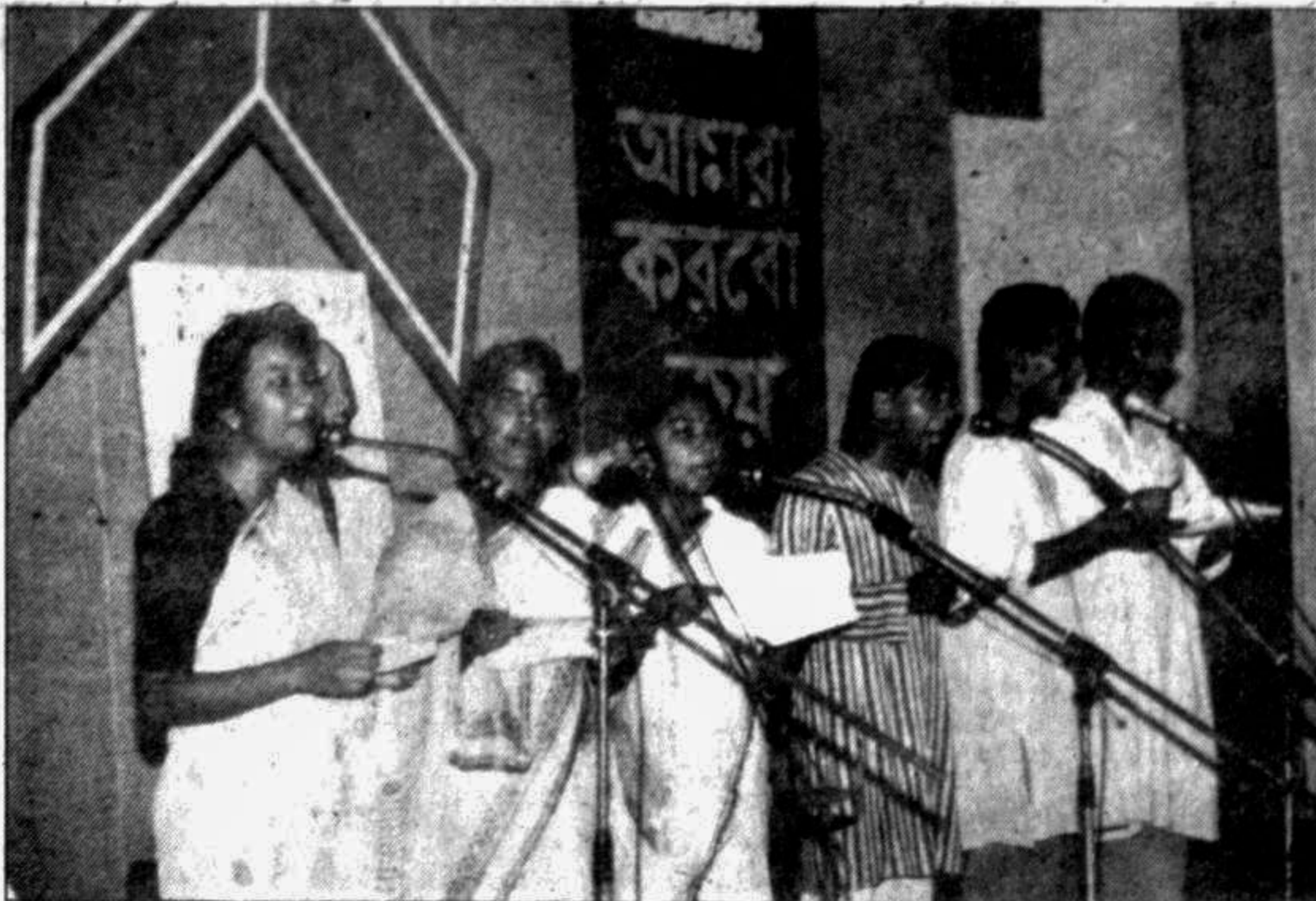
RAJSHAHI UNIVERSITY: The artistes of 'Swanan', a local cultural organisation rendering songs at a function held at RU campus in observance of the death anniversary of poet Kazi Nazrul Islam recently.

The installation was followed by an attractive cultural function.