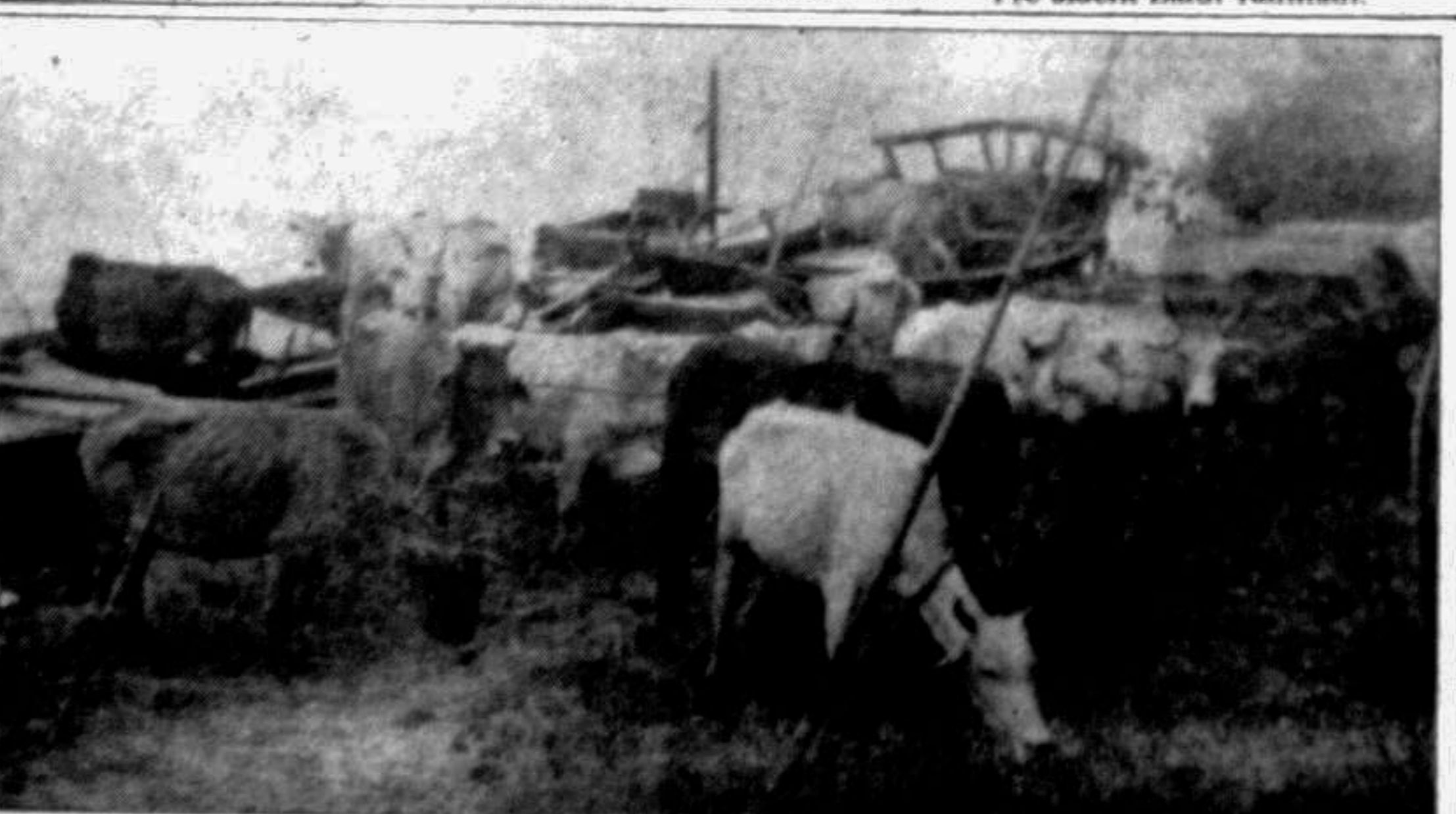
JAMALPUR: Local thana police recovered 83 Indian cows from Nandiana ferryghat under Sadar thana of the district recently.

A meeting of the district Zia parishad has called for effective implementation of the 19-point programme to materialise the dream of Shaheed Pre-sident Ziaur Rahman.