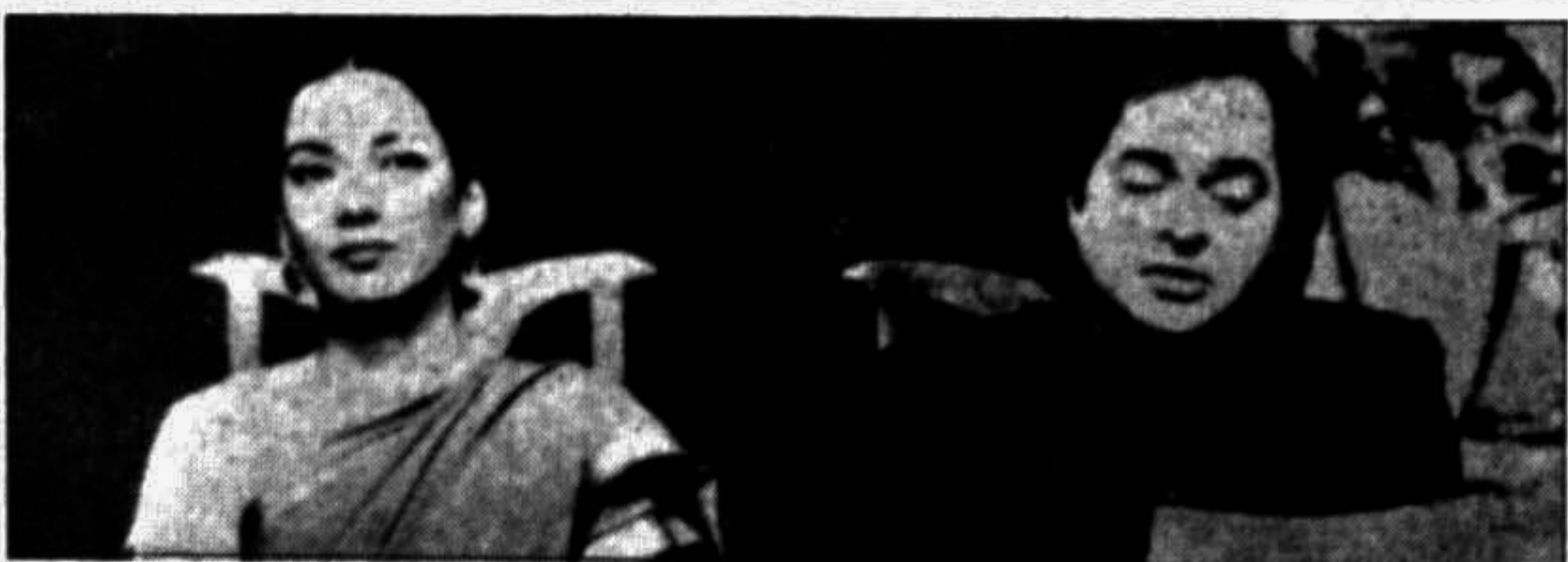
Shabana Azmi and Farooque Shaikh, two noted cine artistes of India, are seen in the picture. They will perform in the play 'Tumhari Amrita' to be staged in Dhaka on September 20, 21 and 22.