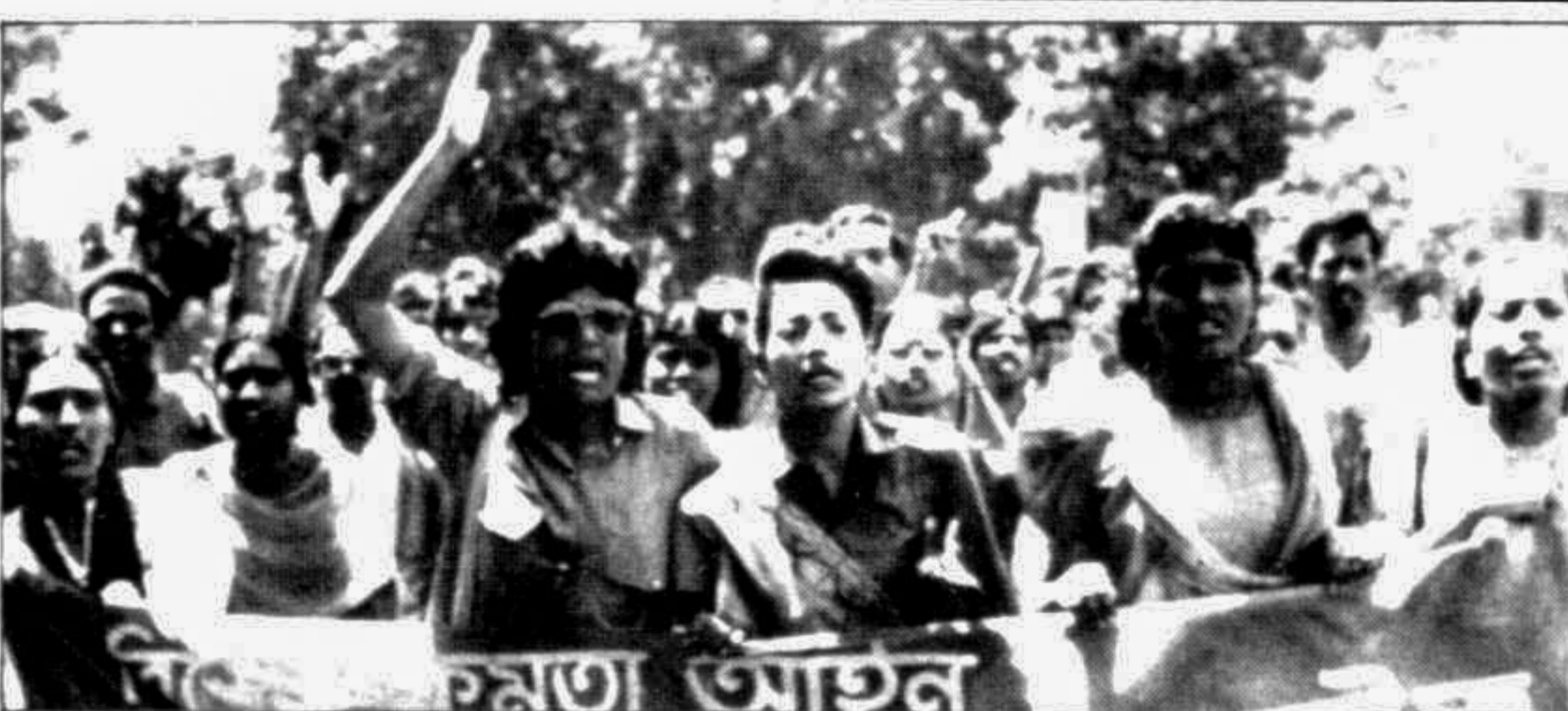
Charti Chhatra Sangathan brought out a procession in the city yesterday demanding repeal of all black laws including Special Power Act.

They discussed the matter of bilateral interest and parliamentary activities of the both countries.