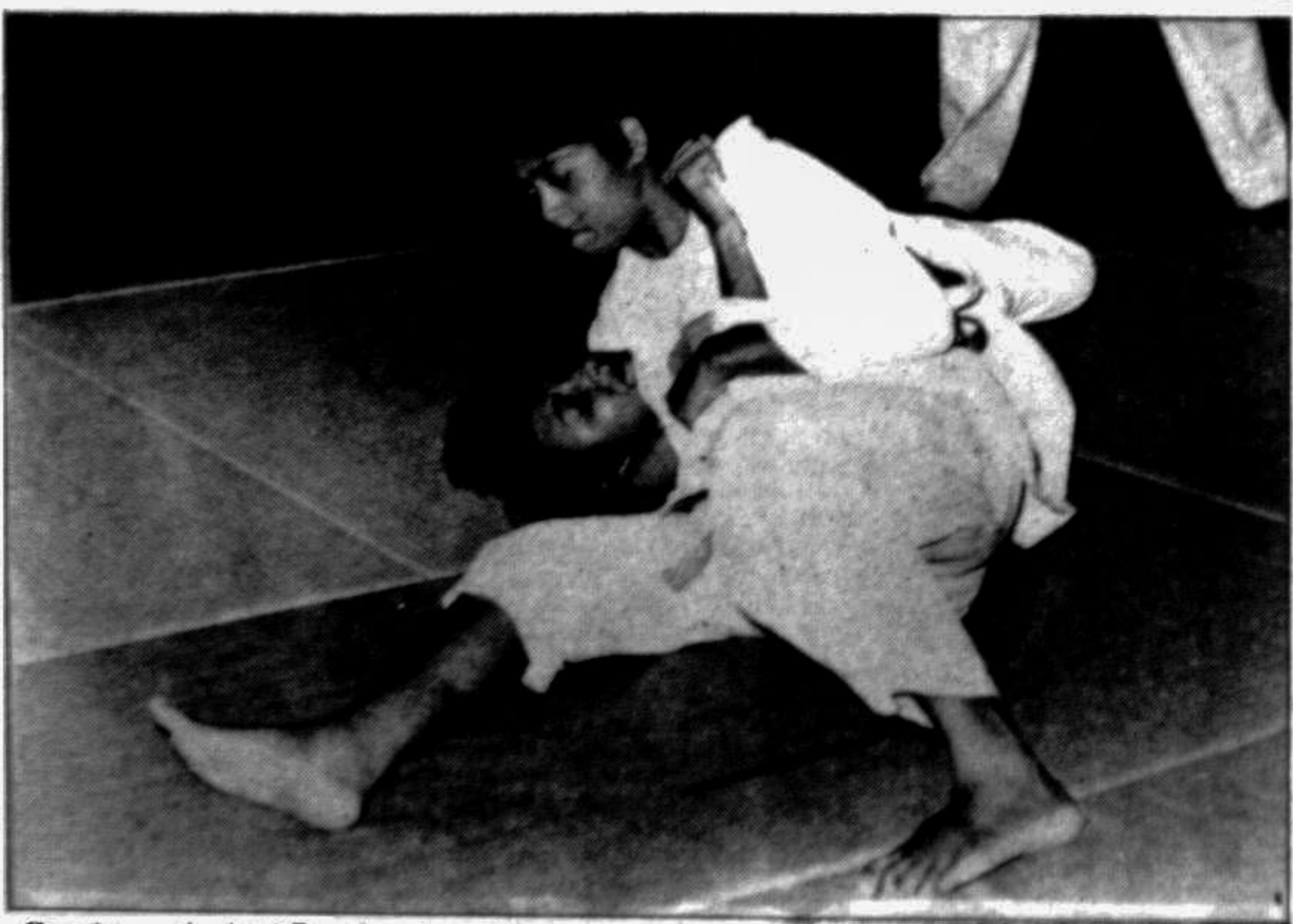
Caught on the hip: Two female judokas of Surja Barun Club and Dhanmudi Club in action on the first day of the two-day Sadharan Bima judo competition yesterday at the NSC judo room.

During their last meeting in Reykjavik, Iceland, in 1972, Spassky managed to win only two of 21 games he played against Fischer.