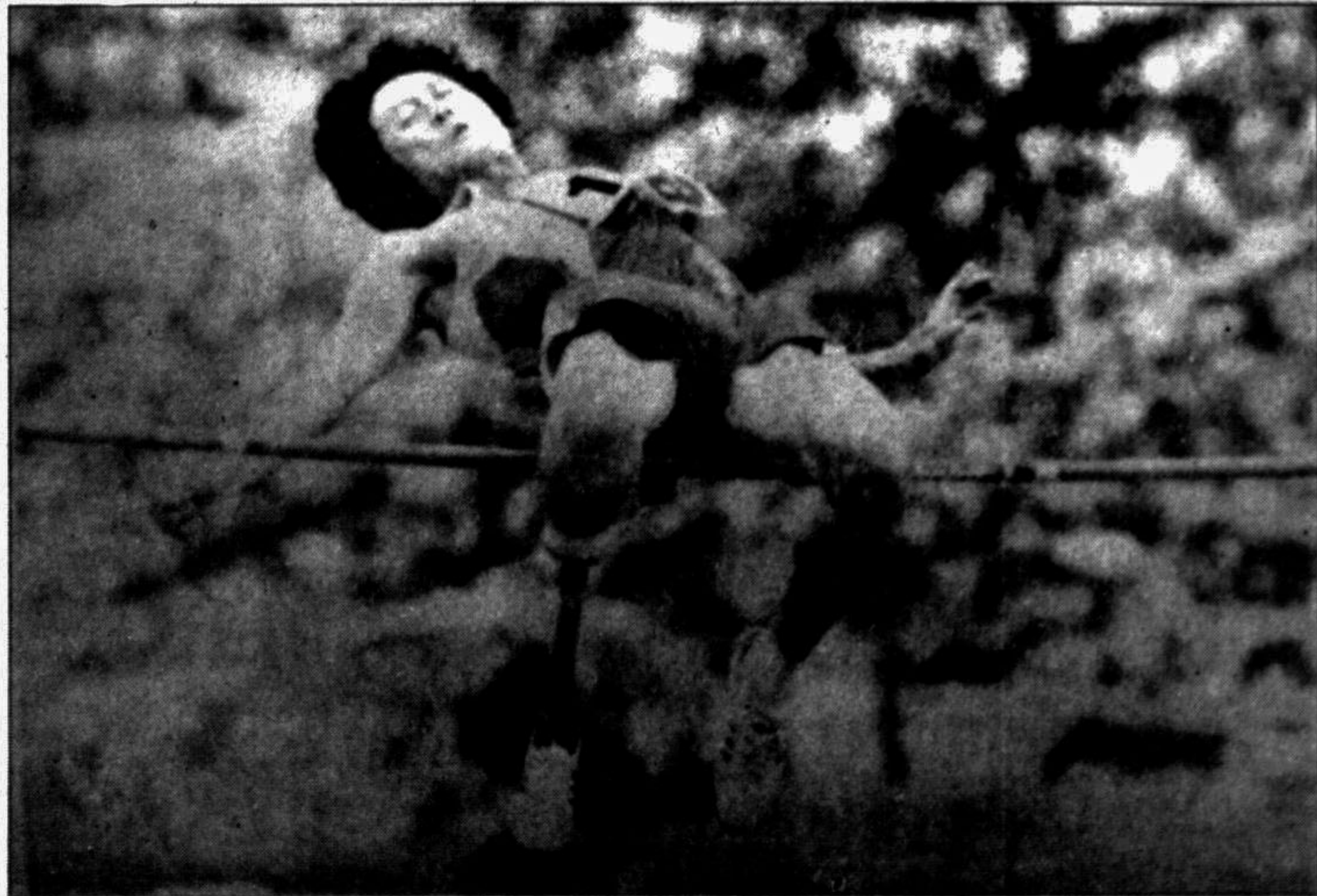
Chinese athlete Zhao Yi in action during the high jump event of the IXth Paralympic Games in Barcelona's Montjuic Olympic Stadium on Sunday. Zhao won the gold clearing 1.79m.

NEW DELHI, Sept 7: India and Pakistan are likely to host the World Cup cricket jointly once again, reports PTI.