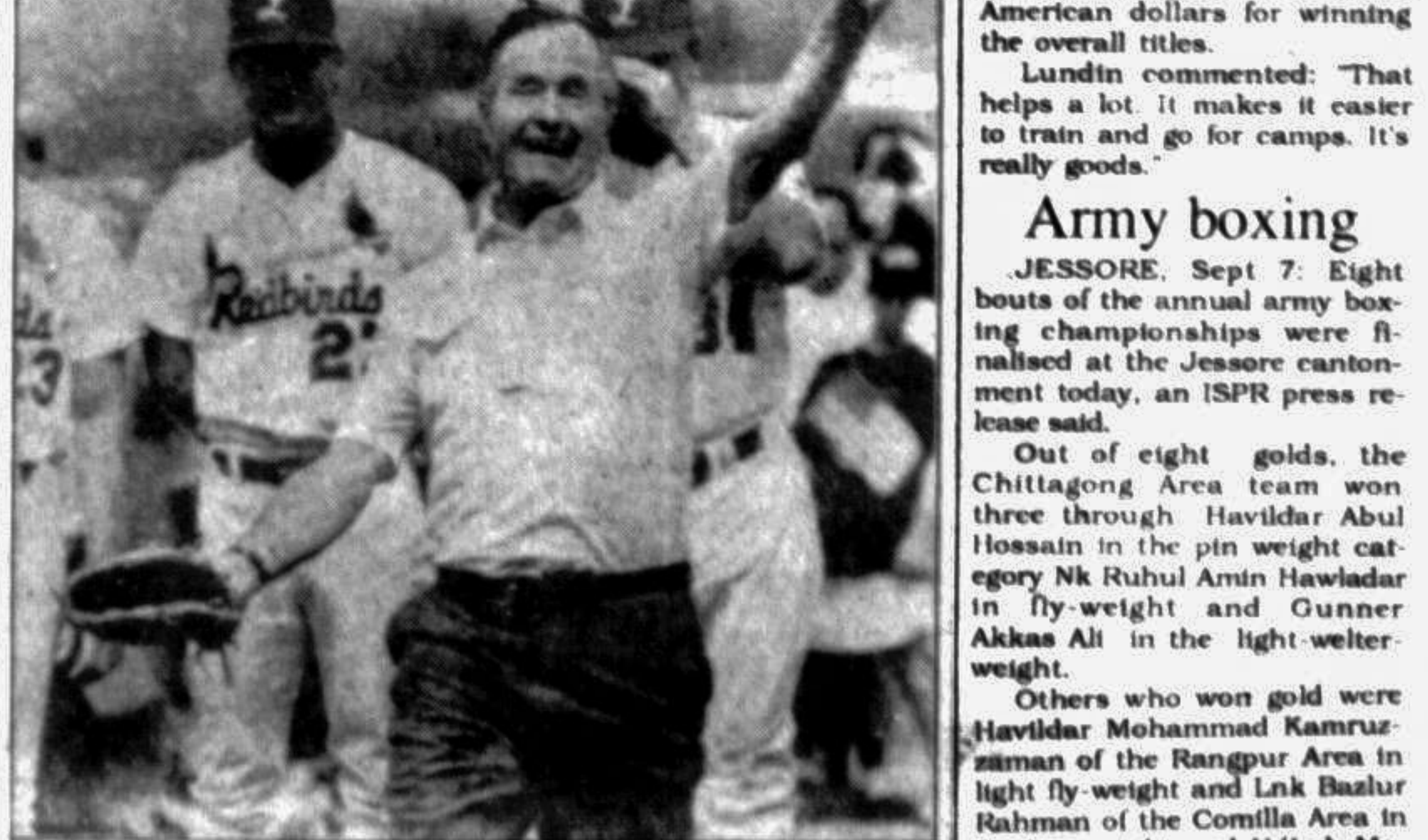
US President George Bush make the first pitch at a local baseball game during a Labour Day campaign stop in Louisville, Kentucky on Sunday.

JESSORE, Sept 7: Eight bouts of the annual army boxing championships were finalised at the Jessore cantonment today, an ISPR press release said.