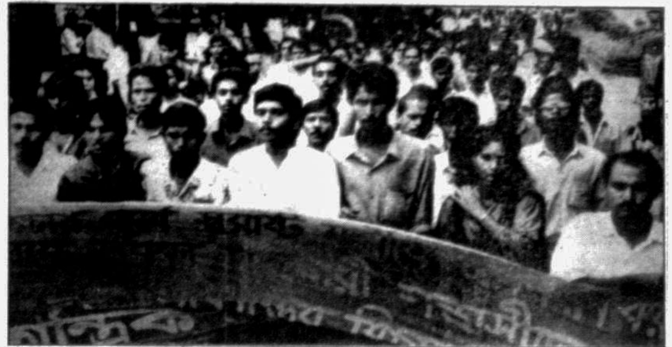
GCO procession on the Dhaka University campus in protest of violence yesterday.

Later, the Chief Election Commissioner met the district-level officials at the conference room of the Deputy Commissioner office and exchanged views with them about the coming by-elections and union parishad polls.