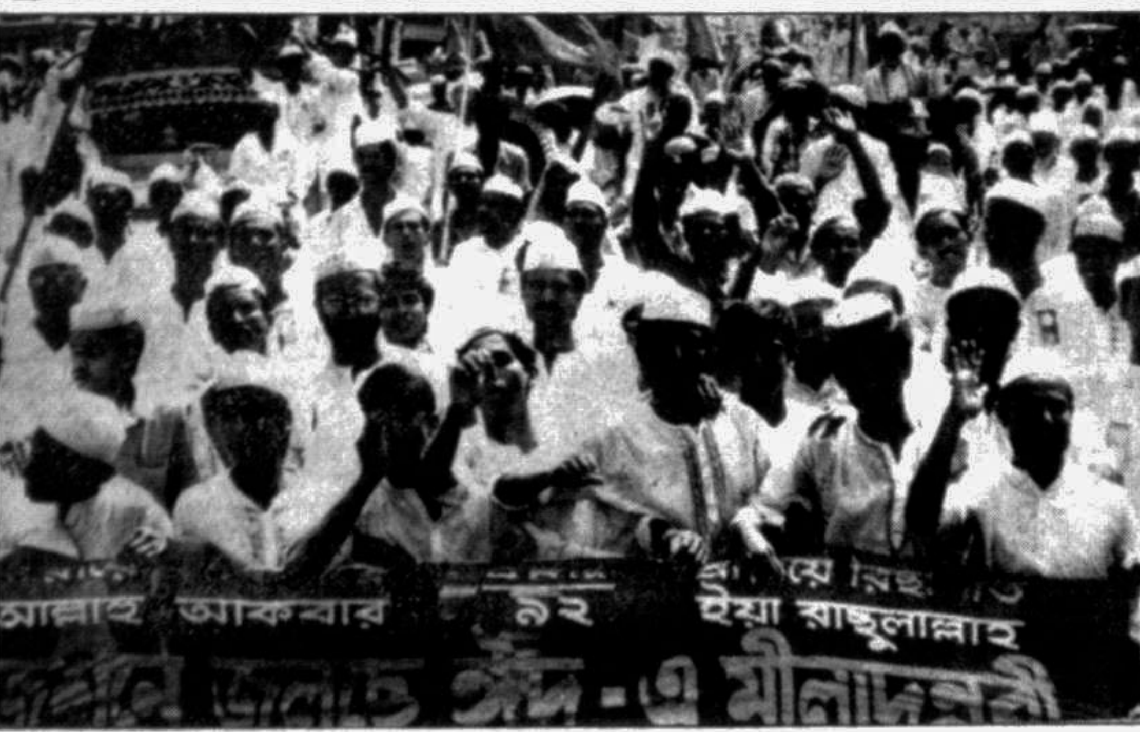
A procession in the city yesterday in observance of Eid-e-Miladunnabi.

The leader said if the government failed to answer why the murderers of the three persons were not arrested by the police, it would mean the government was not sincere in eliminating terrorism.