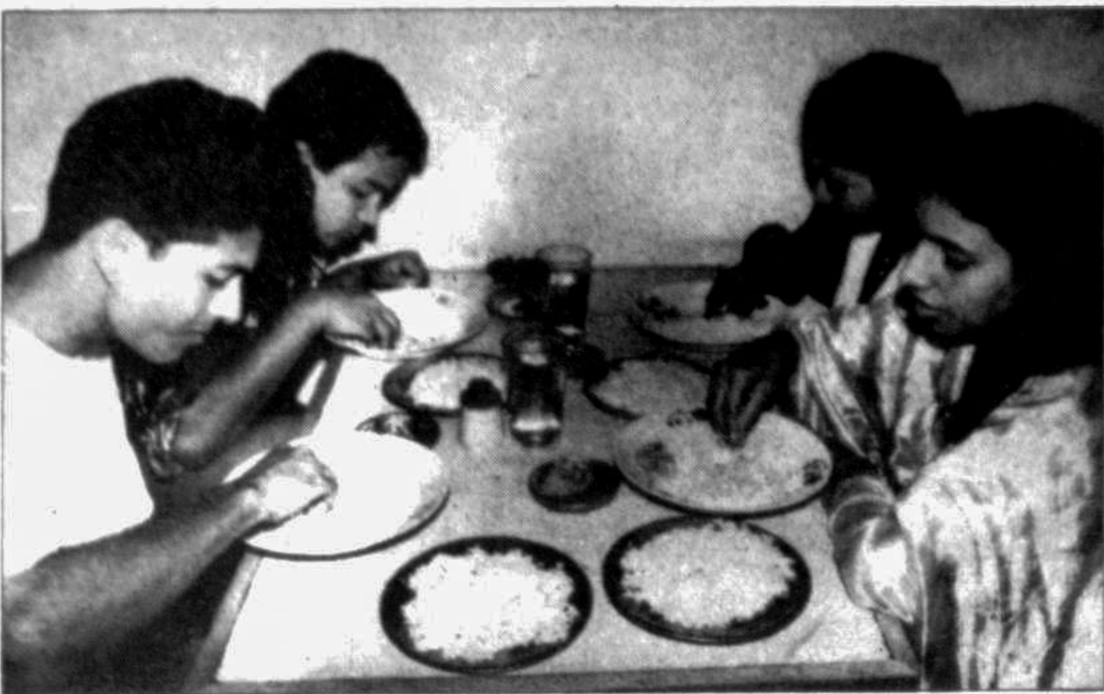
'Nirob' a place rarely silent.

The way video stores and eating places are proliferating the city one may be prone to believing that a certain proportion of the 110 million people are turning into professional couch potatoes and major gluttons. If we stick to just the affairs of the stomach, it is amazing how hundreds of restaurants boasting 'authentic cuisine' can be seen at every corner of Dhaka. Yet how many of them actually serve the so called 'authentic food'? More importantly, how many of them are affordable to the average person?