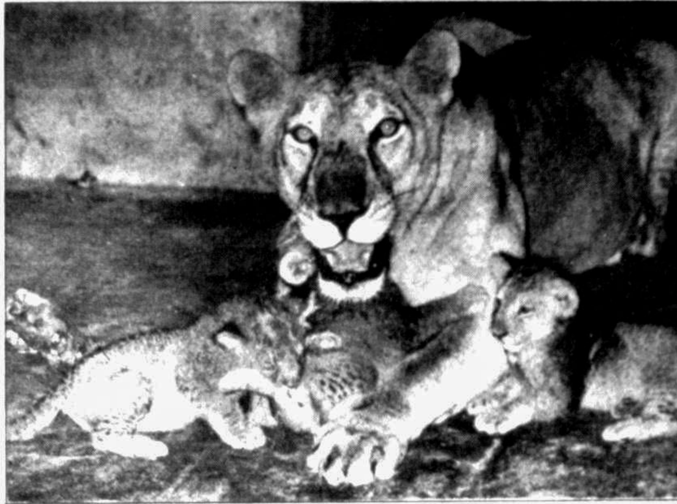
Growth of population is problem number one of Bangladesh. Not so always. Growth in the number of inmates of the National Zoo at Mirpur is an enriching thing — not only the zoo gets richer by way of its exhibits, but it can sell the new 'accessions' at a premium price to zoos around the world or exchange them with species not yet on our zoo. The other day the National Zoo was doubly blessed by the birth of four cubs to a Royal Bengal tigress and another four to a Gujarati lioness brought from India. Both the mothers are doing fine and the cubs frolicking and fooling around. Caution: The rare picture that their cages present of filial love — is also specially dangerous for the eager viewer. These predator mothers are the most ferocious when they are nursing their cubs.