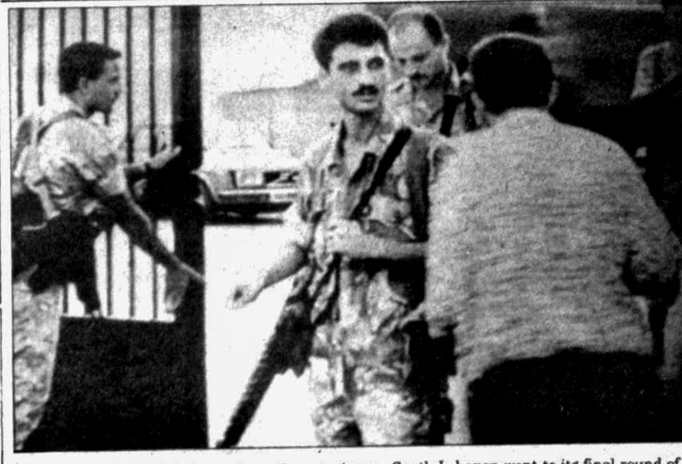
Soldiers stand guard in front of a polling station as South Lebanon went to its final round of polls yesterday. Story on Page 5

A country-made bomb was hurled into the premises of the Green Herald International School at Mohammadpur in city yesterday morning.