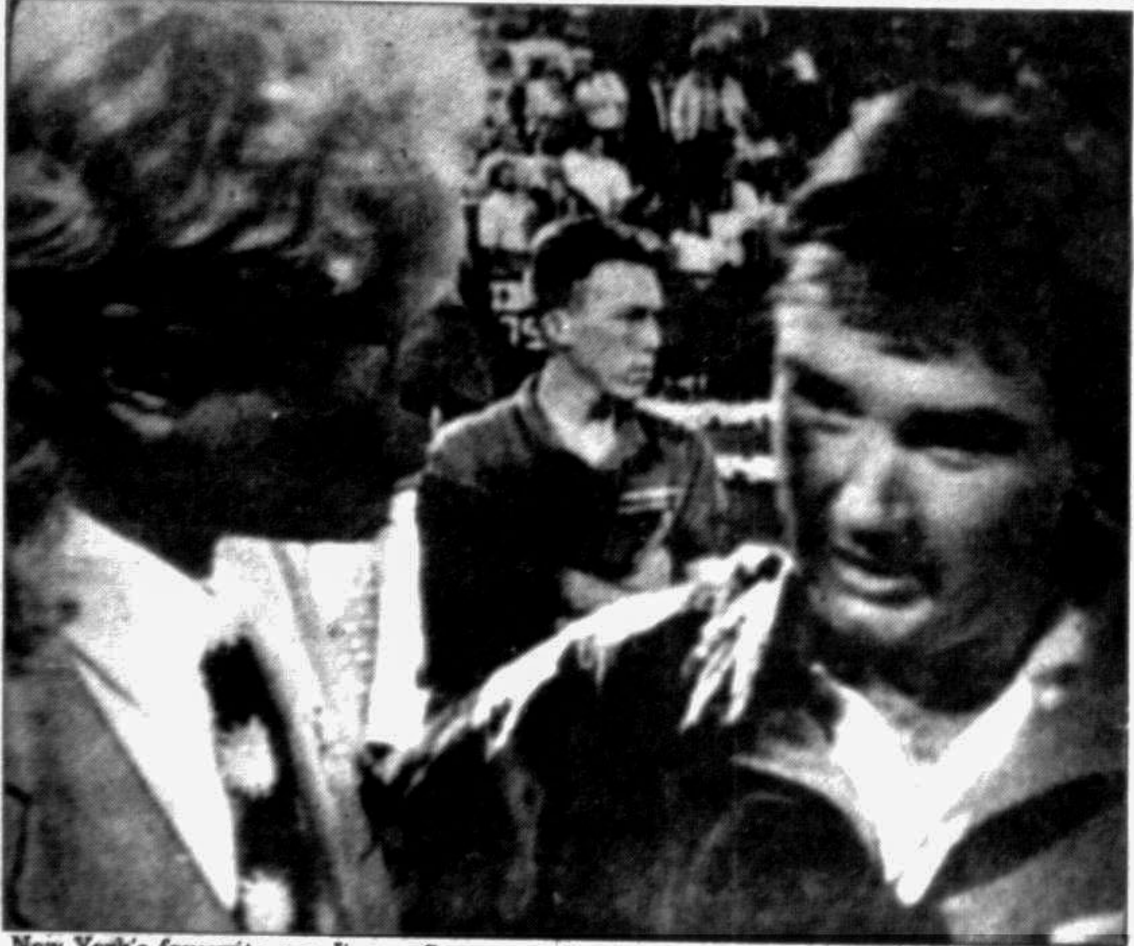
New York's favourite son Jimmy Connors, who celebrated his 40th birthday last Wednesday, being interviewed by TV after his second round exit from this year's US Open Saturday.

"There is no guarantee that this scheme will work but all we have to do is to give it the best shot we have," he said.