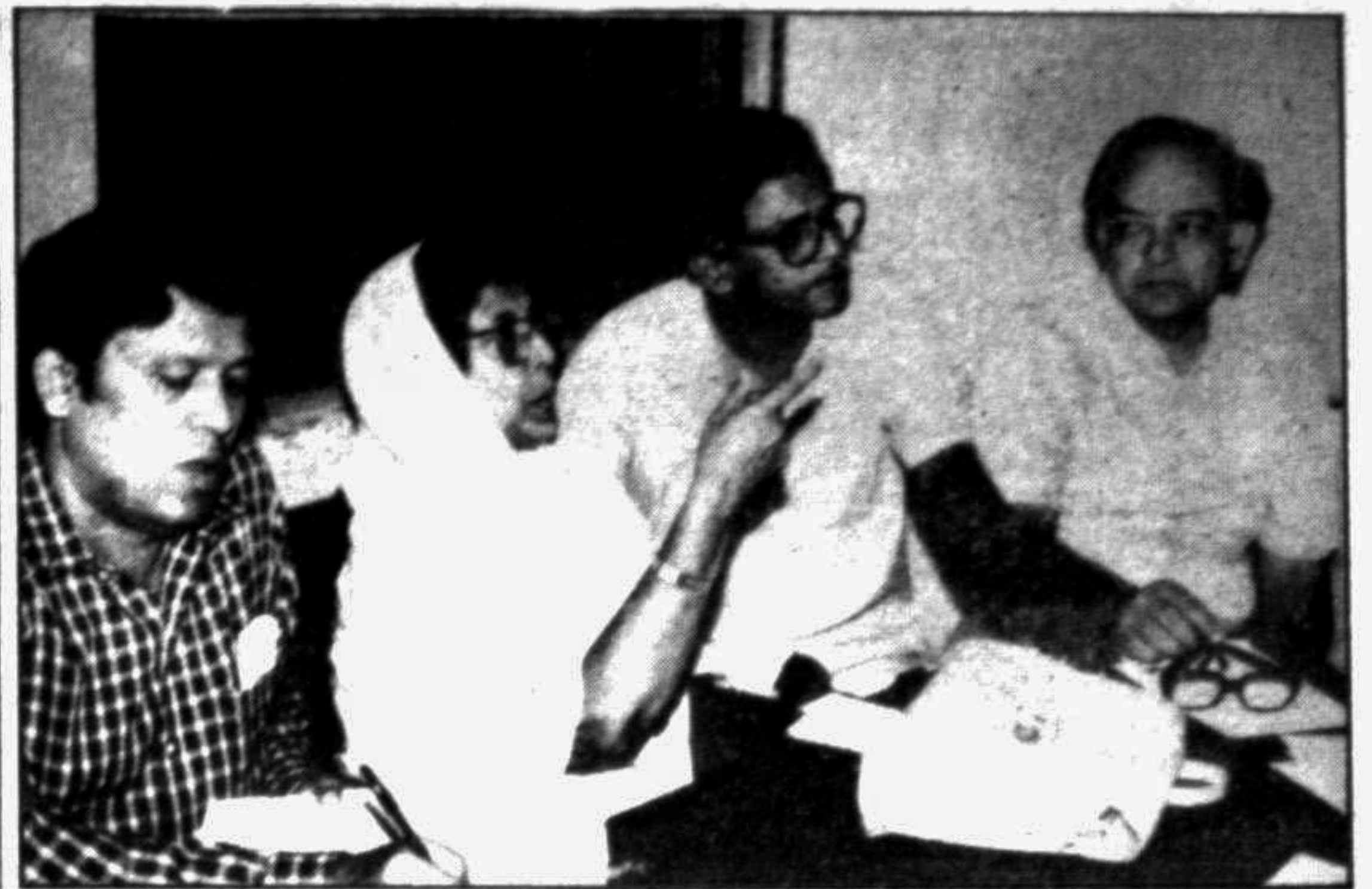
Jahanara Imam addressing the representatives' conference of Nirmul Committee held at Bangabandhu Avenue yesterday.

A case has been filed with the Tajgaon police station.