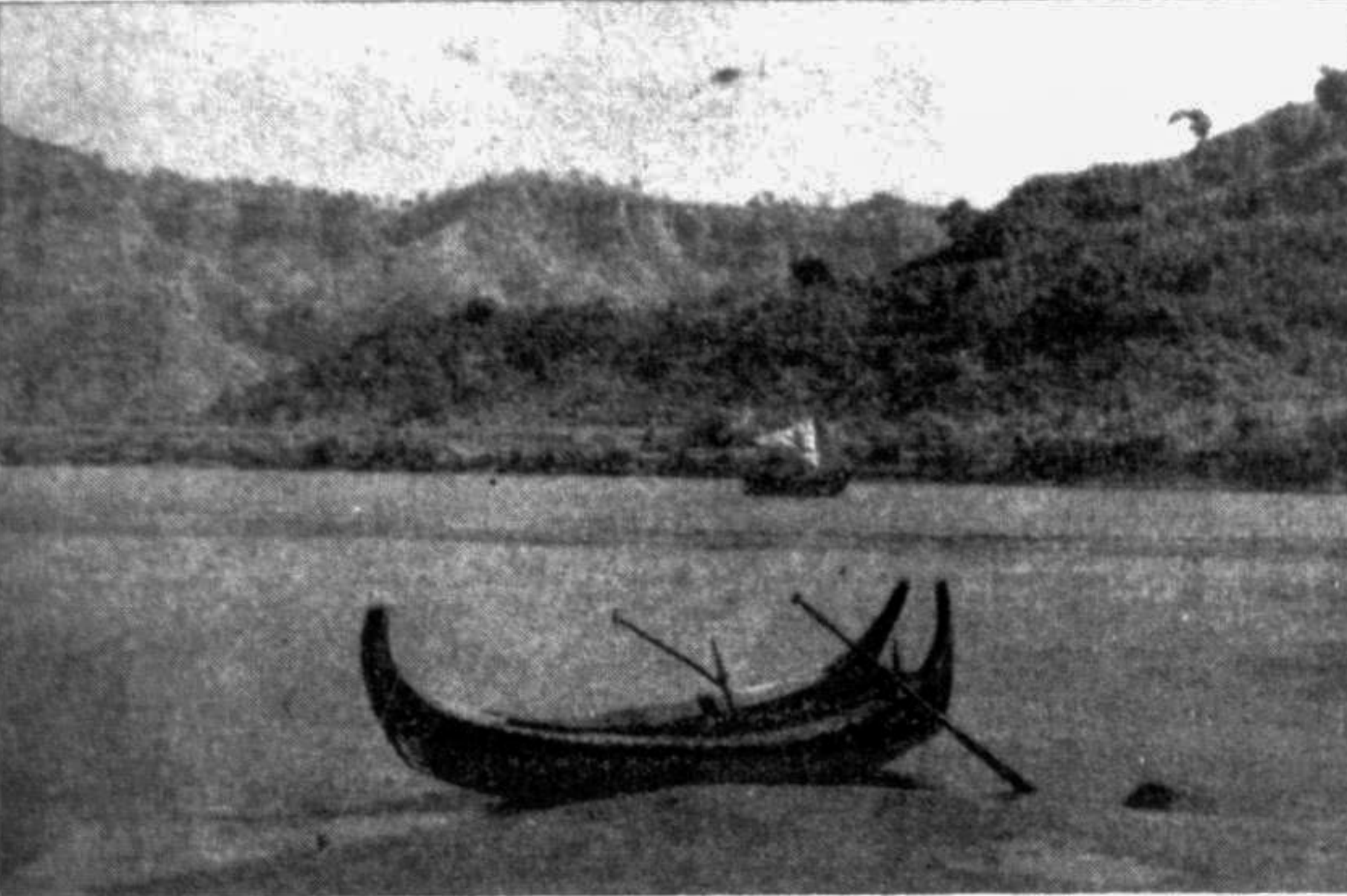
A Shampan still reminds one of the typically Chittagong way of life.

Primary and secondary education in the city is also in doldrums. The established schools,