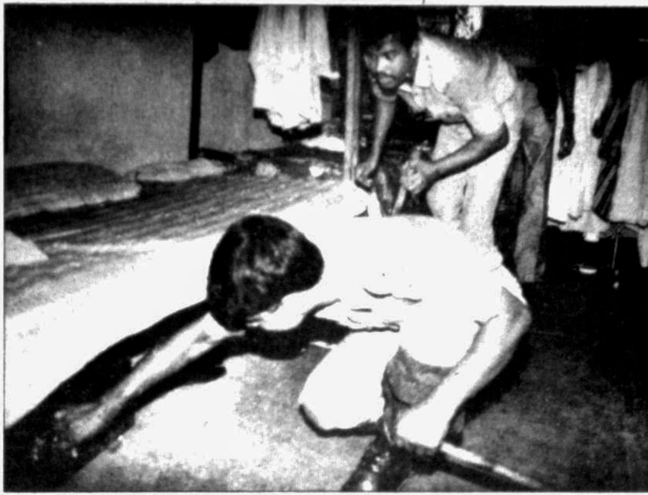
Police raided Sahidullah Hall of Dhaka University Saturday afternoon.

The study group isolated several mosquito larvicidal bacteria among which the Bacillus Sphaericus SI-1 was found to be the most potent. This bacterium was isolated from normal dead larvae, researchers said adding: "The isolated bacterium has been found to be effective against non-infected mosquito in the laboratory." The researchers observed that the bacterium is hundred times as powerful as the WHO strain in killing mosquitoes. The mosquitoes responsible for malaria, filaria and some communicable diseases, are controlled mainly by using chemical pesticides in the developing countries, researchers said. They, however, mentioned that chemical pesticides were causing health hazards and environmental pollution in developing countries including Bangladesh. In the developed countries, they have already introduced bio-pesticides in preventing the mosquitoes and several other pests, the researchers added.