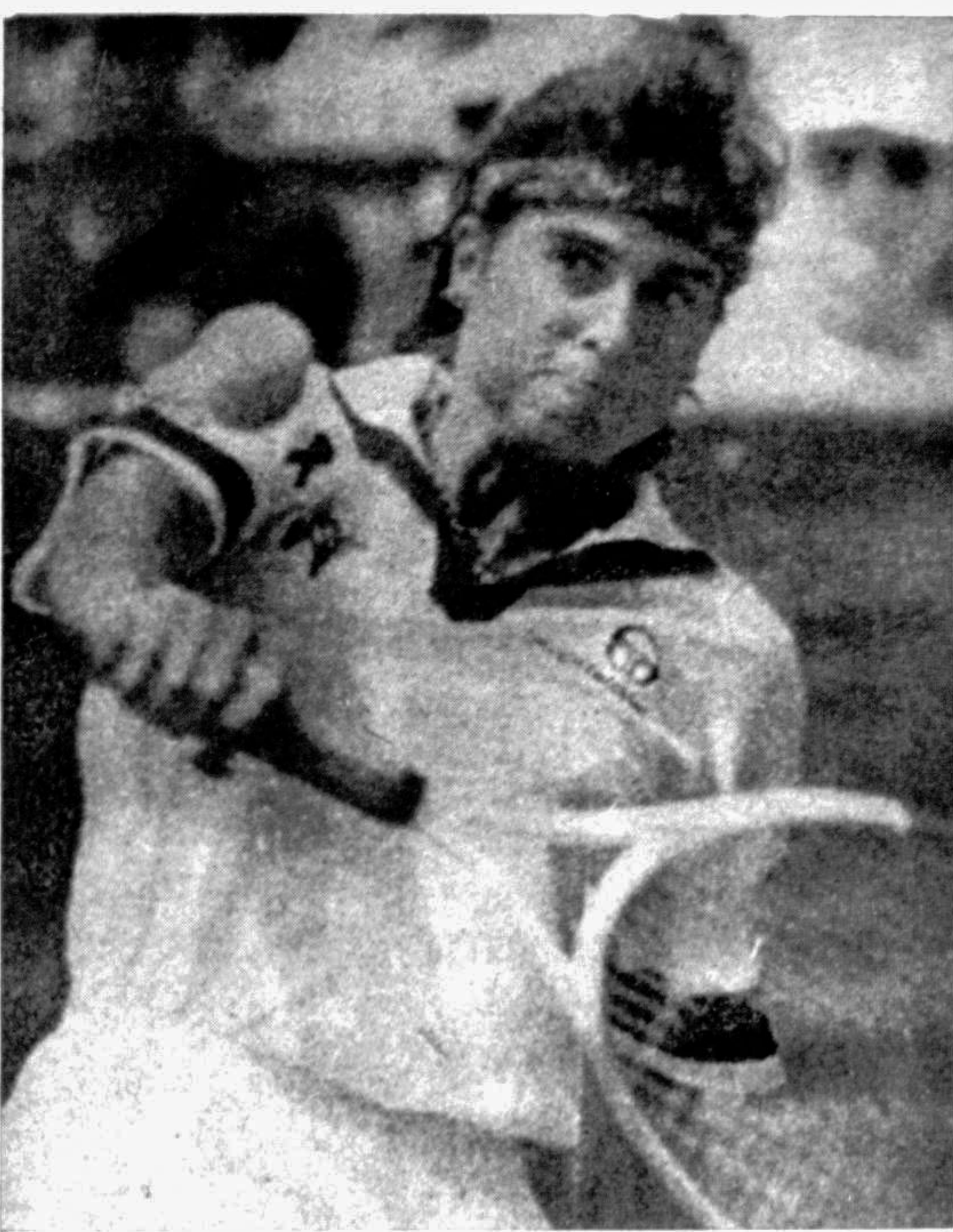
Argentine Gabriela Sabatini, the fourth seed, makes a backhand return to Natalia Zvereva of the CIS in her gruelling third-round match of the women's singles of the US Open at Flushing Meadow on Friday. Sabatini won in 2 hrs and 33 mins 6-4, 5-7, 6-4.