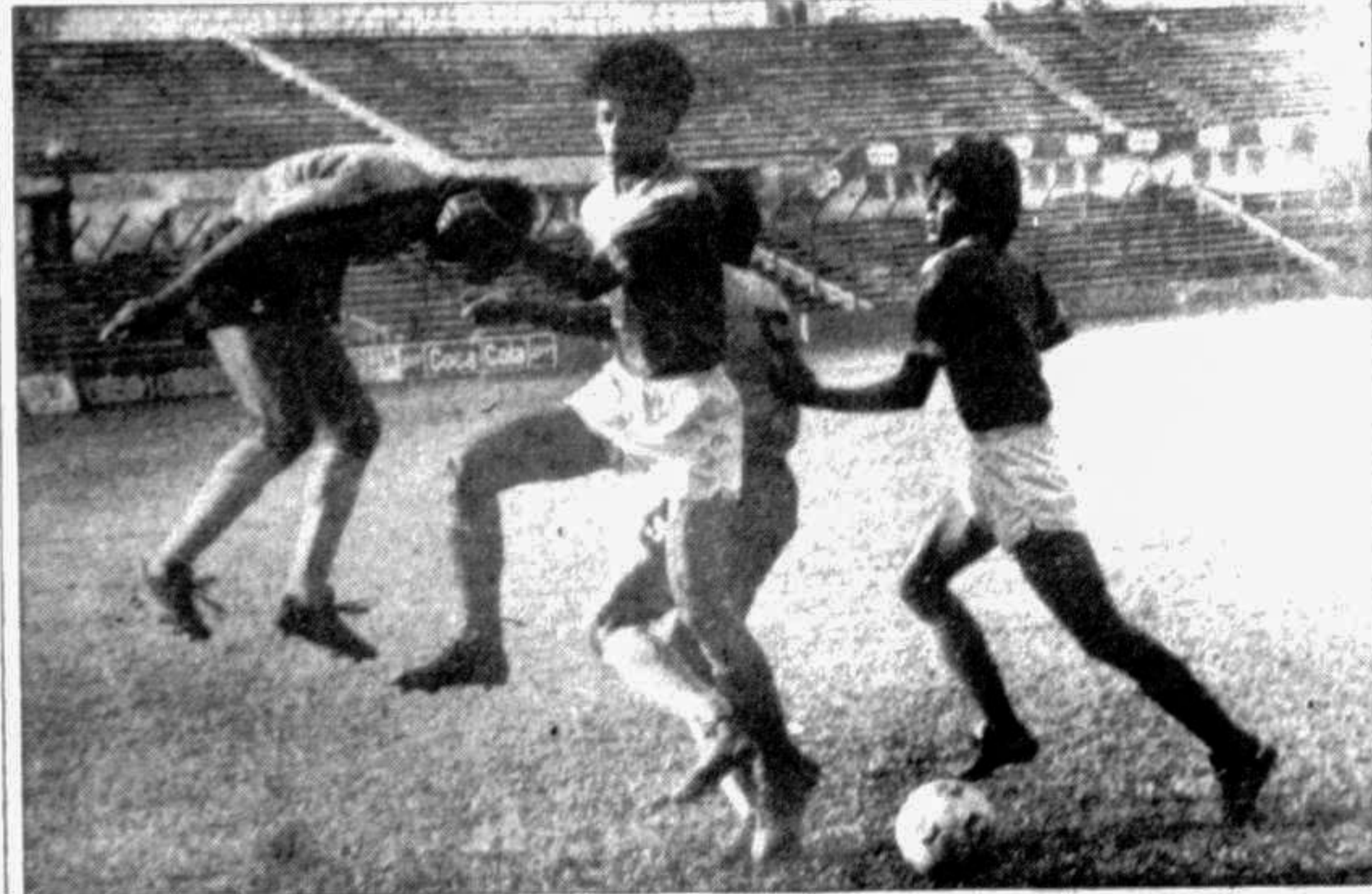
Action from yesterday's Second Division football match between Prantik Boys Club and Azad Sporting Club at the Dhaka Stadium.