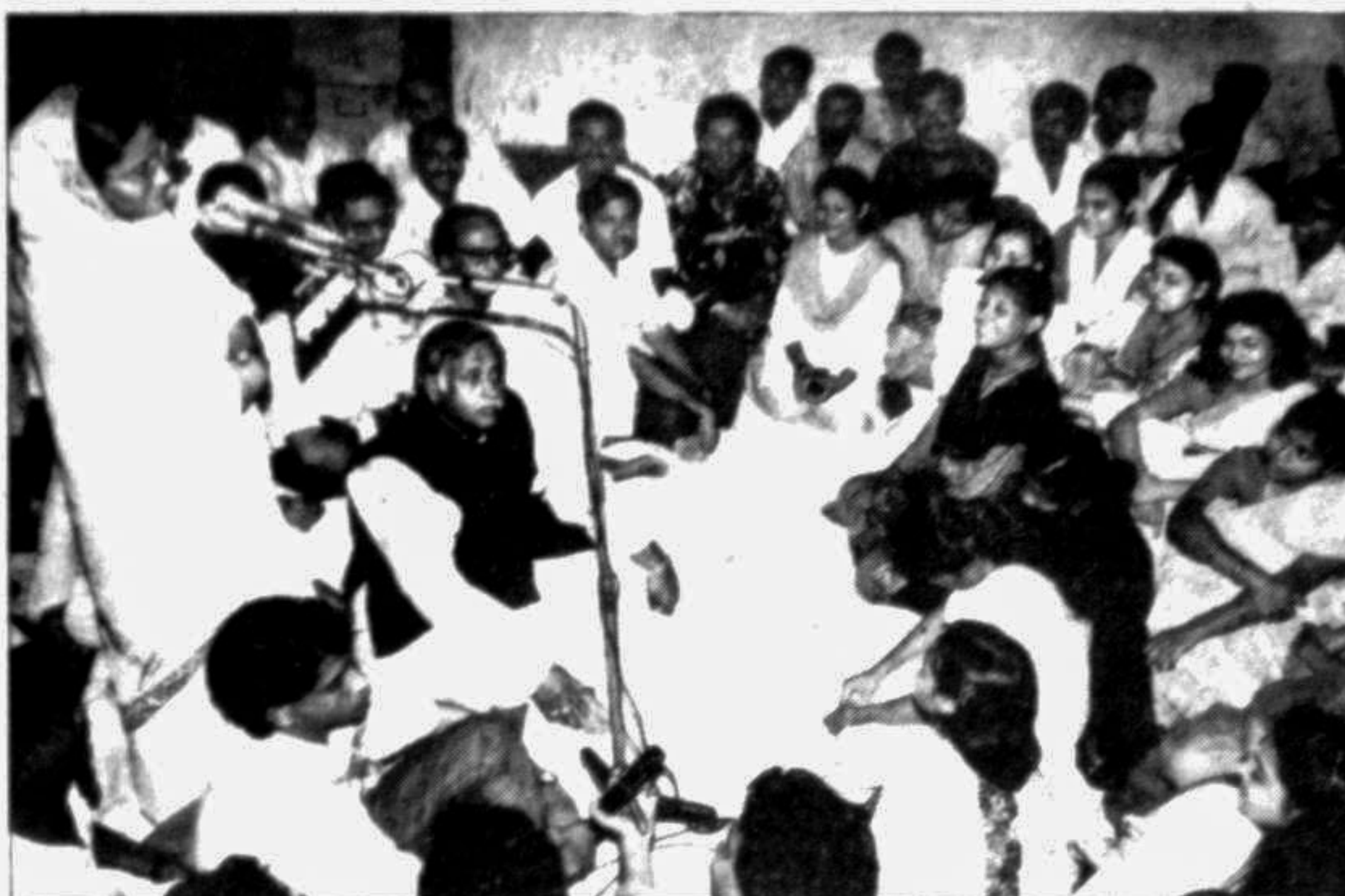
Awami League Chief Sheikh Hasina addressing a political training course of Bangladesh Chhatra League (M-I) at the party office yesterday.

In these days of rising trend of prices of books, a large number of readers turn to public libraries to satisfy their reading needs. From this aspect, a properly equipped library is a blessing for a community.