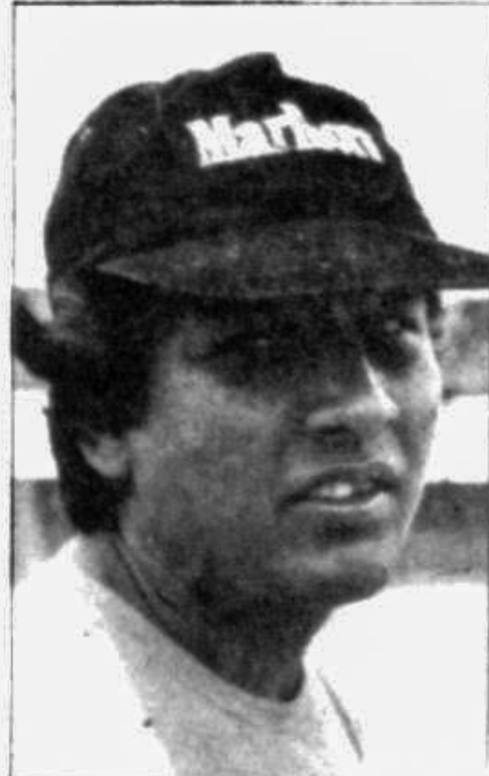
INZAMAMUL HAQ... 119

Pakistani Waqar Younis, accused of ball doctoring by the English press after Pakistan's recent 2-1 Test series run, grabbed five wickets to send the Indians crashing for 226 in reply to Pakistan's total of 247 all out.