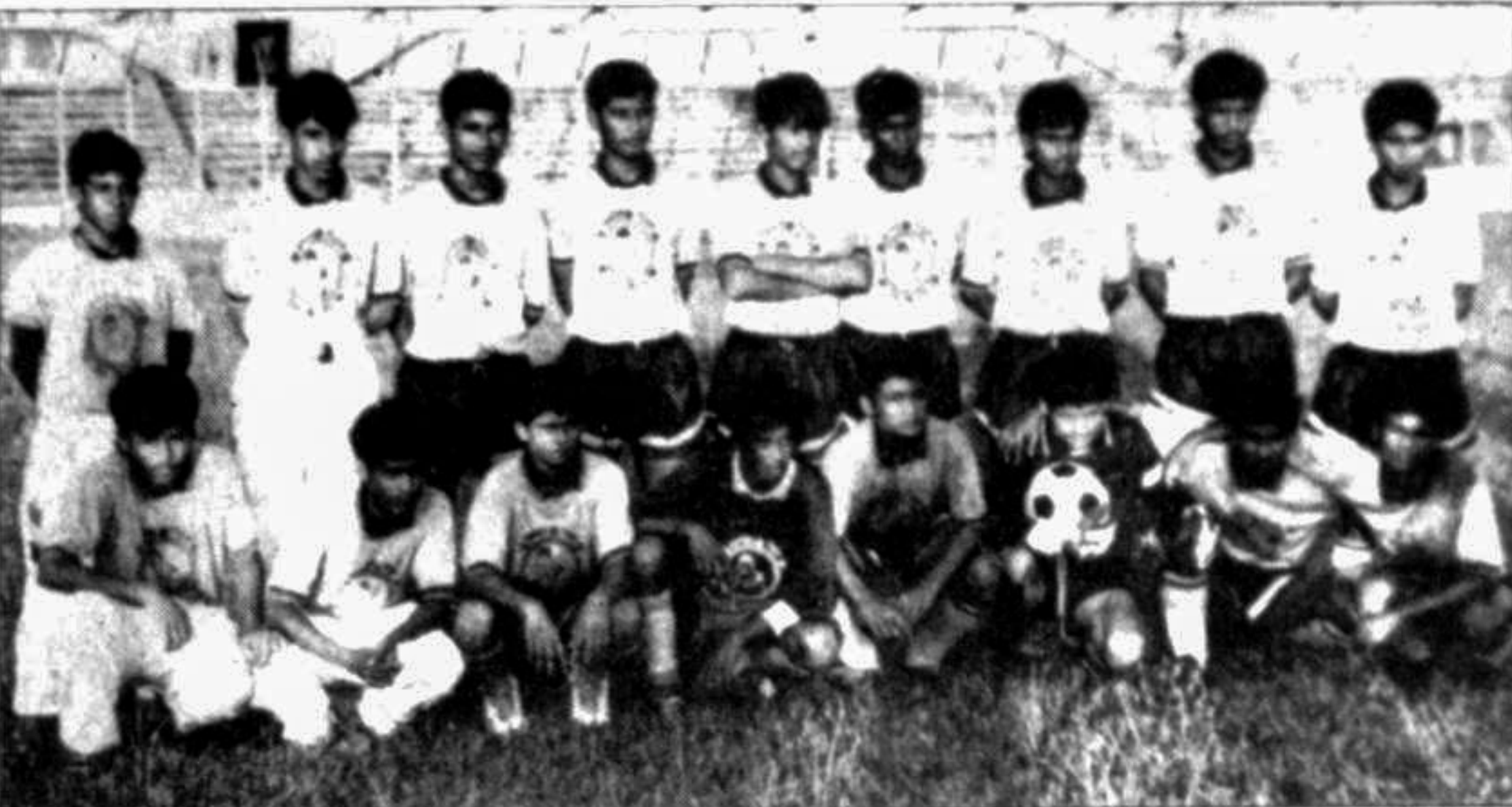
The proud booters of Tangail DSA, who became champions of the Ma-o-Moni Gold Cup national under-14 football tournament which concluded at the Dhaka Stadium yesterday, pose for photographers after the final. Tangail beat Feni 2-1.