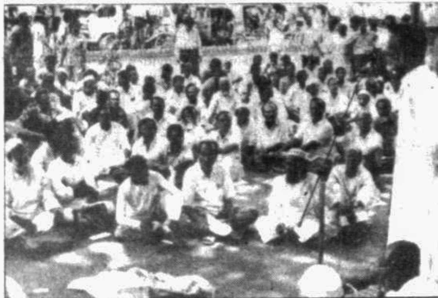
A rally of the secondary school teachers in front of the Jatiya Press Club yesterday.

The meeting presided over by Information Minister Nazmul Huda also considered the progress of works of the decisions taken earlier in this respect.