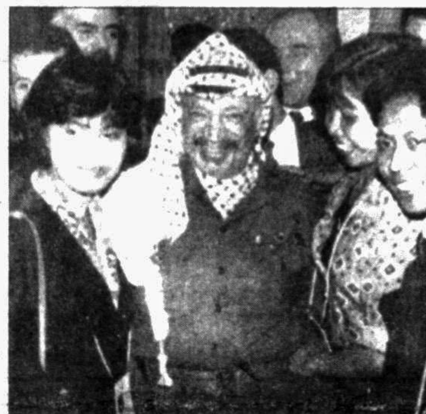
PLO chief Yasser Arafat (centre) takes time off for a photo with staff and liaison officers after a long day of speeches at the 10th NAM summit Thursday.