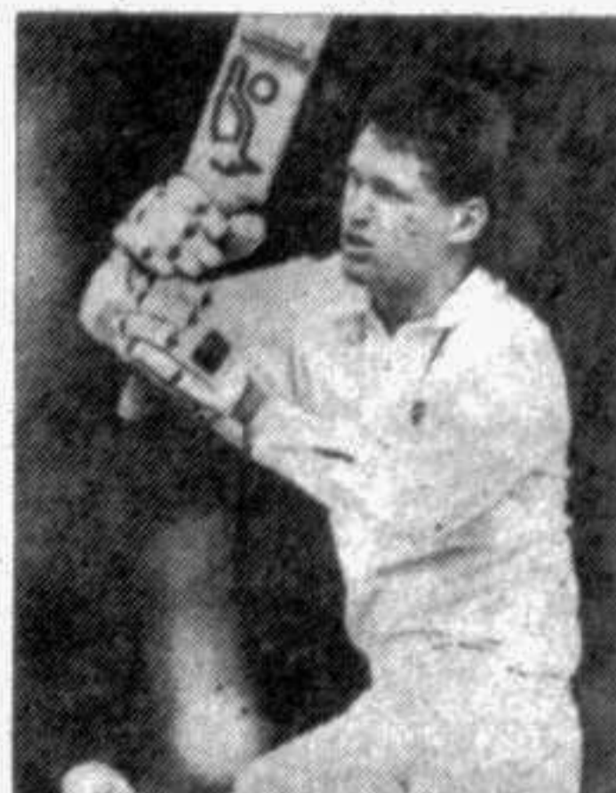
D JONES ... century

final day of the second cricket Test between Sri Lanka and Australia Wednesday: