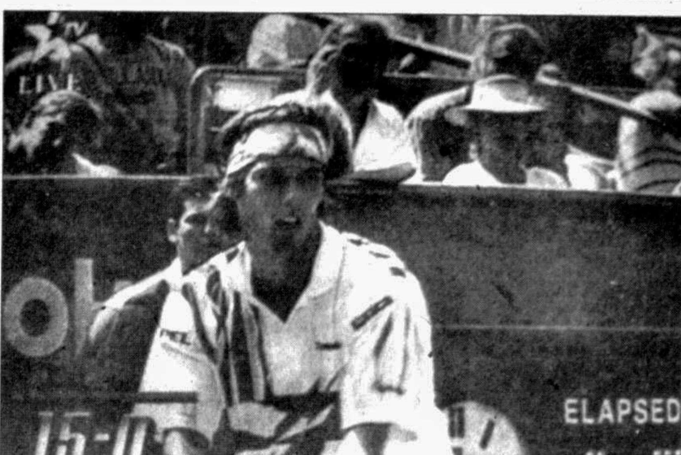
Former Wimbledon champion Michael Stich of Germany on way to beating Frenchman Oliver Delaitre in the first round of the US Open in New York Tuesday.