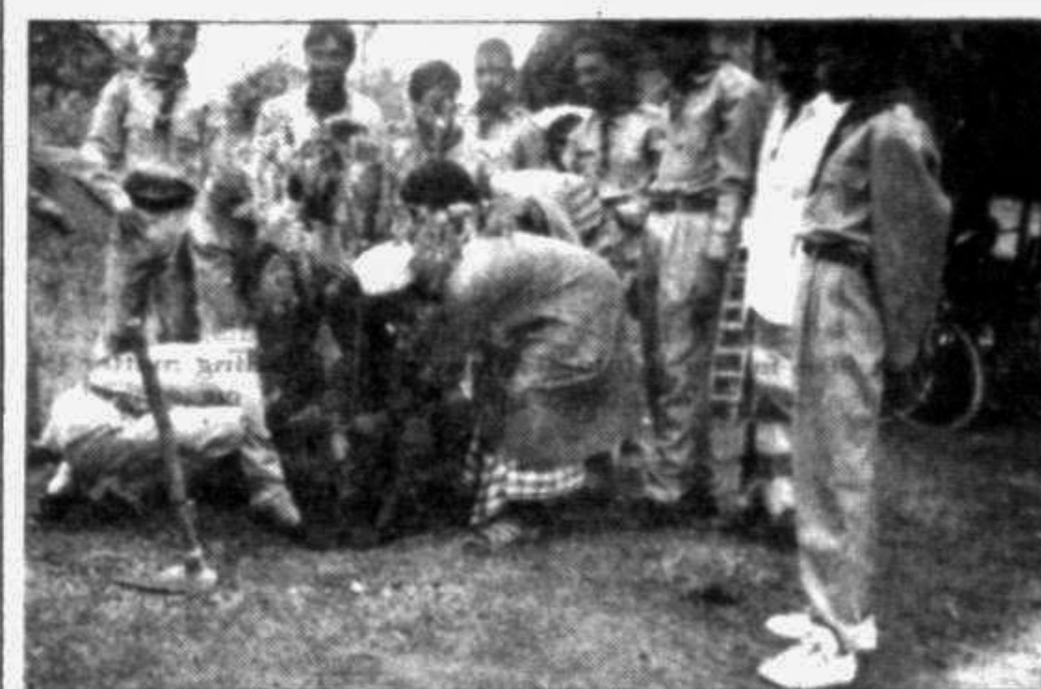
RANGPUR: The scouts are seen planting saplings at Raghu Primary School ground of Azizulla village under Rangpur Sadar thana recently.