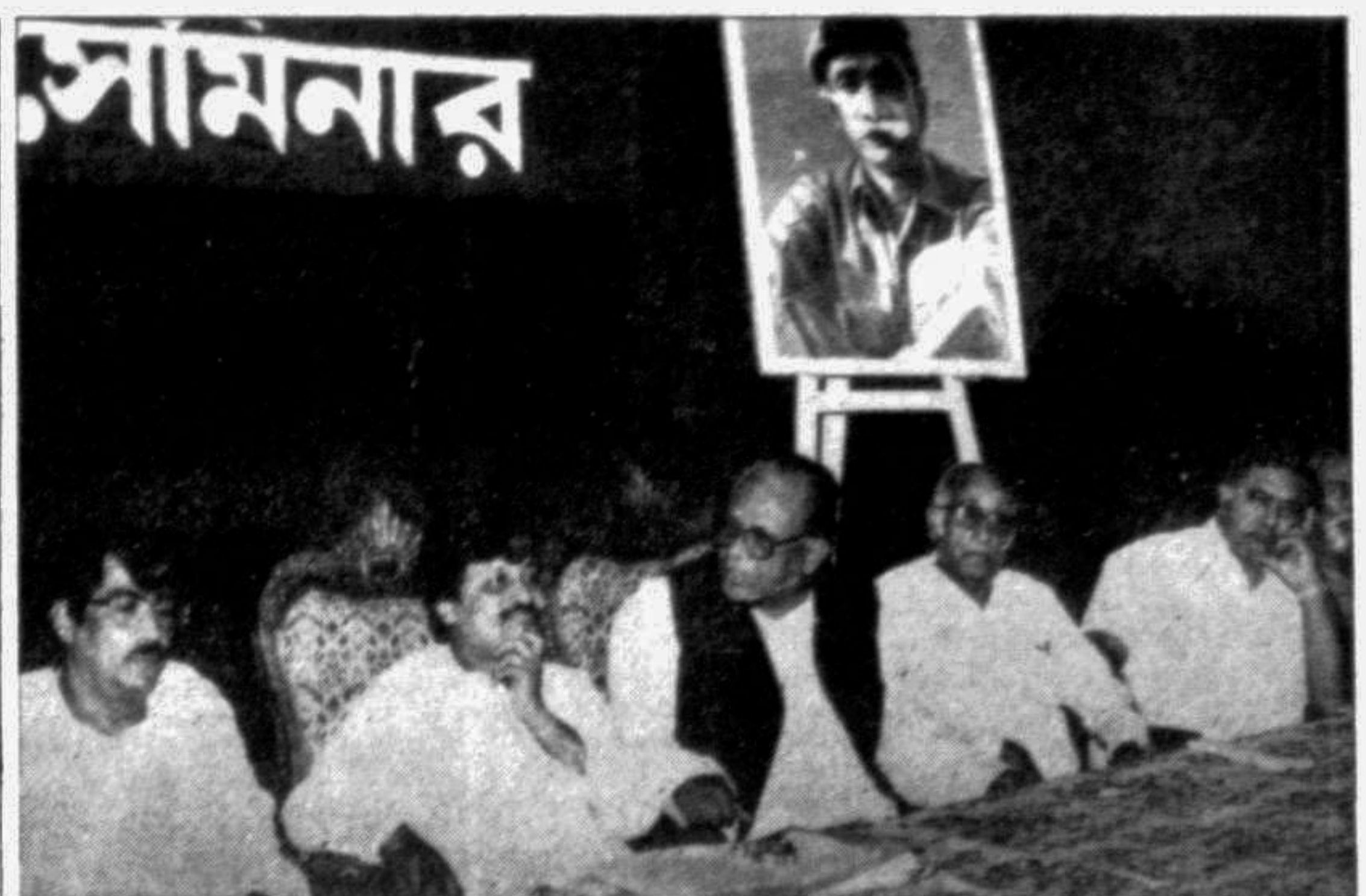
Osmari Smriti Parishad held a seminar at the Shishu Akademi yesterday in observance of the 74th birth anniversary of General Ataul Ghani Osmari.