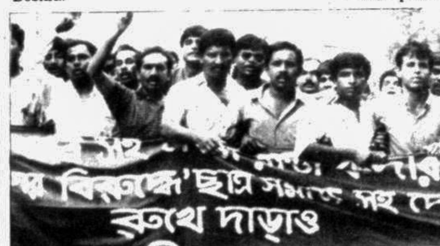
Sangrami Chhatra Samaj brought out a procession in the city yesterday demanding release of deposed President H M Ershad.