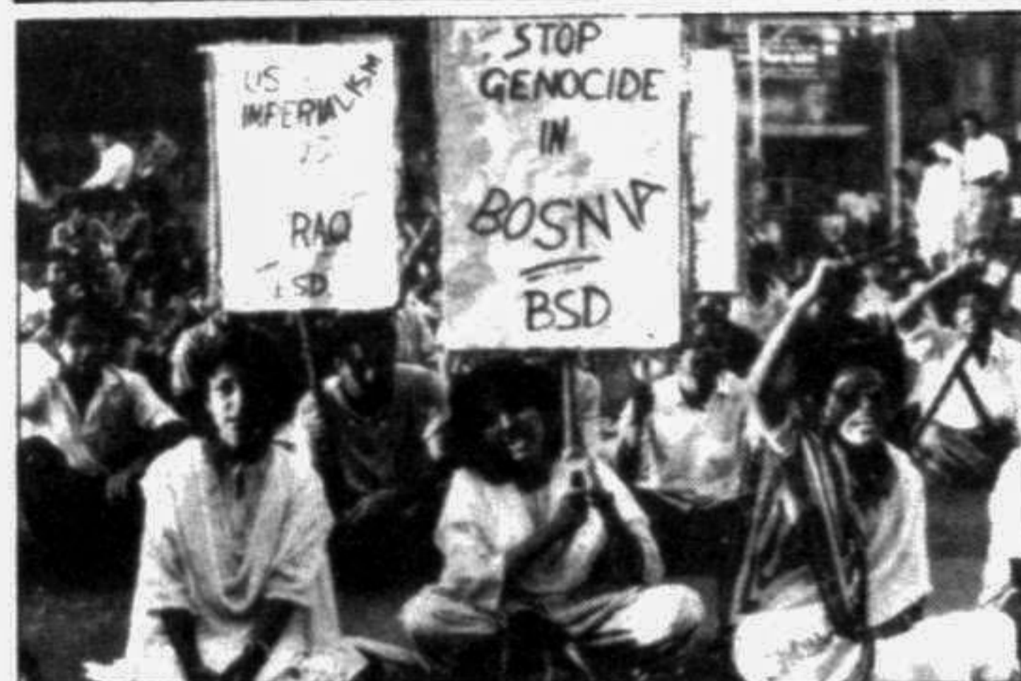
Bangladesh Samajtantrik Dal (BSD) rally in front of the National Press Club yesterday protesting genocide in Bosnia.