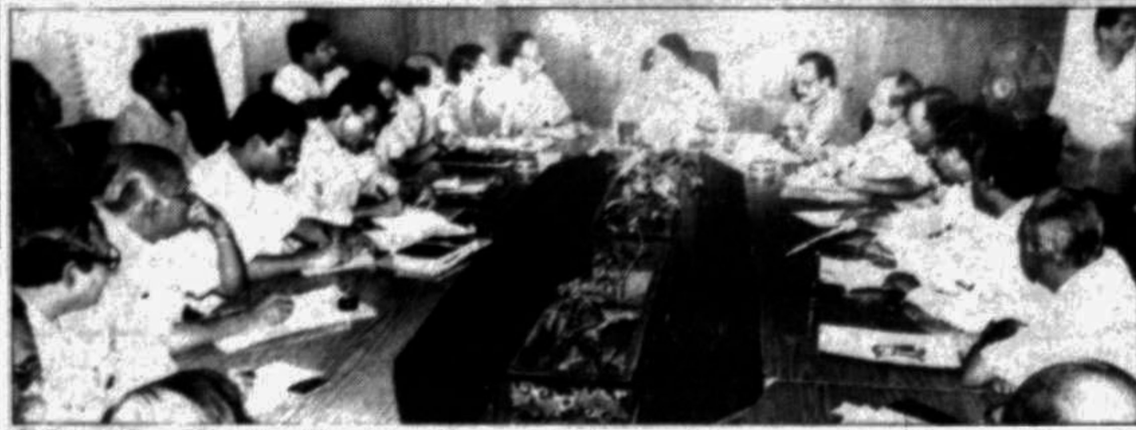
Information Minister Barrister Nazmul Huda presiding over the third meeting of Information and Mass Communication Committee on 7th SAARC Summit at the conference room of Information Ministry yesterday.

and for the welfare and economic emancipation of the people of Bangladesh. Shaheed Zia had given us democracy which was virtually sent to the wilderness by the Awami League in this country, he said.