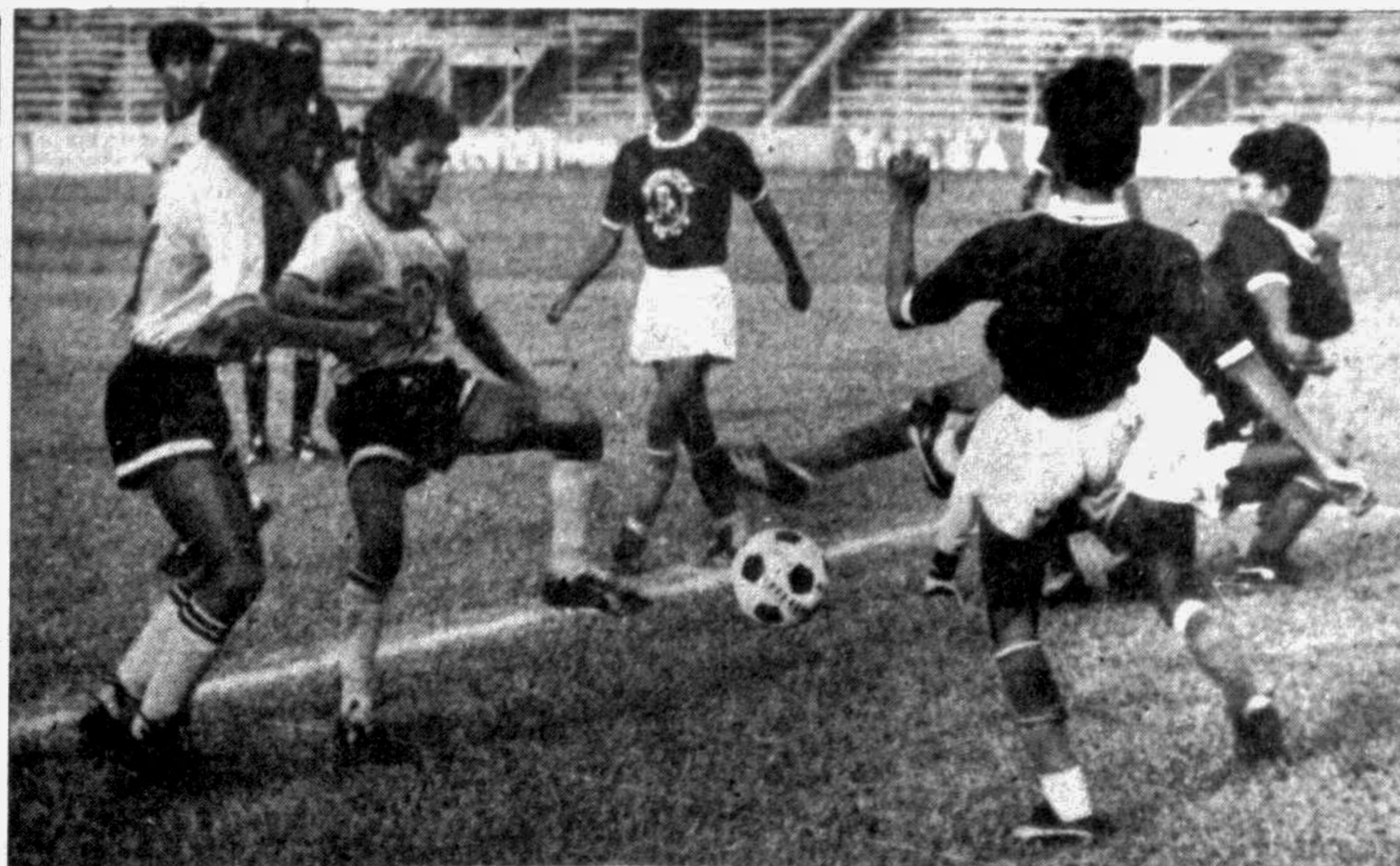
A midfield melee in yesterday's Ma-o-Moni Gold Cup under-14 soccer final phase inaugural match between Tangail and Jhenidah at the Dhaka Stadium. Tangail won 3-1.

Interested players have been asked to contact the Russian Cultural Centre at Dhanmondi by September 2.