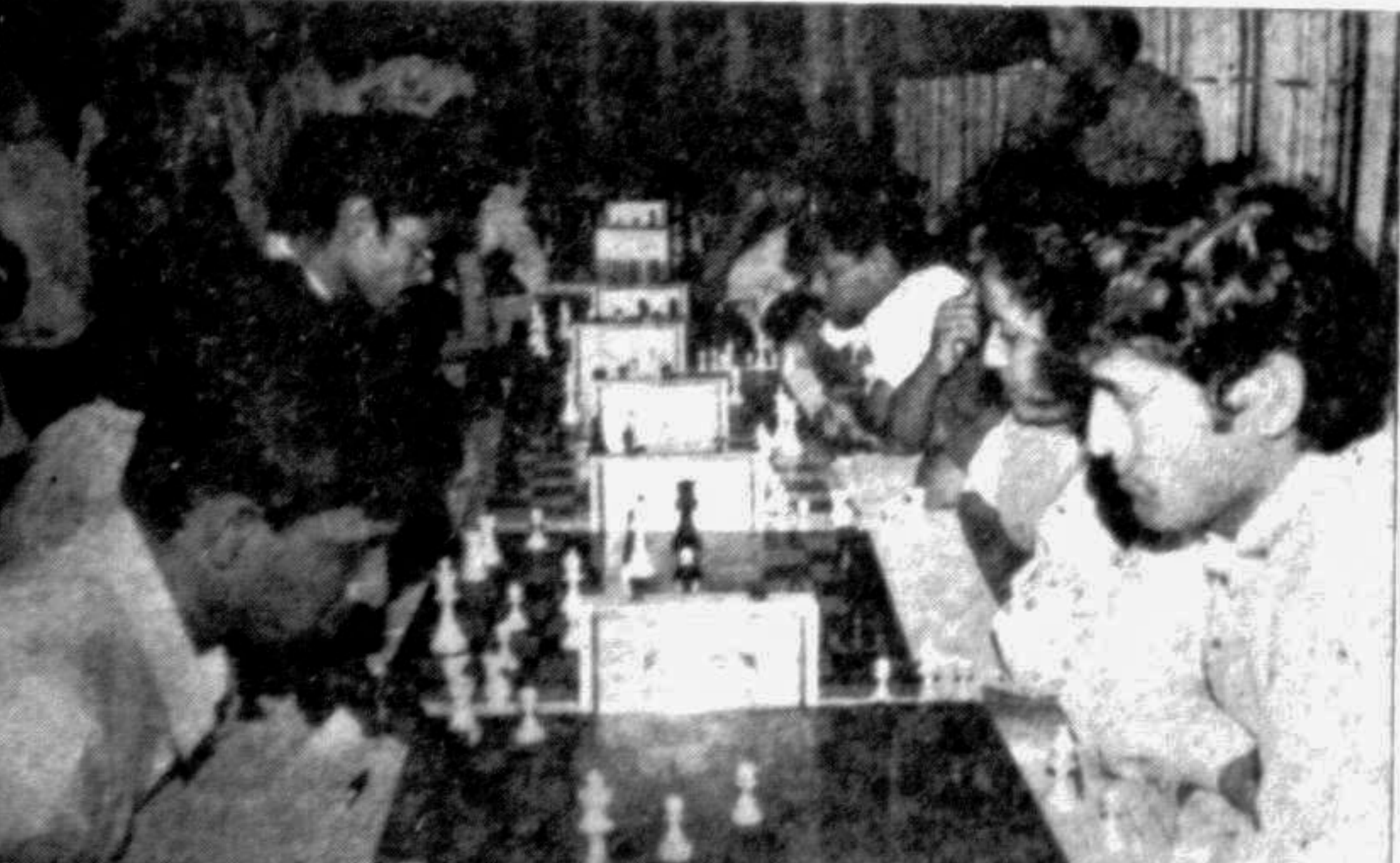
Players trying to lift the balance in their favour during yesterday's sixth round matches of the Foundation Open at the NSC chess room.

The prize money for the runner-up will be 15,000 pounds and for the each semifinalist is 10,000 pounds. The event's sponsor Kent, a British-American tobacco's best selling international cigarette brand, has supported snooker in the far east, including China for many years.