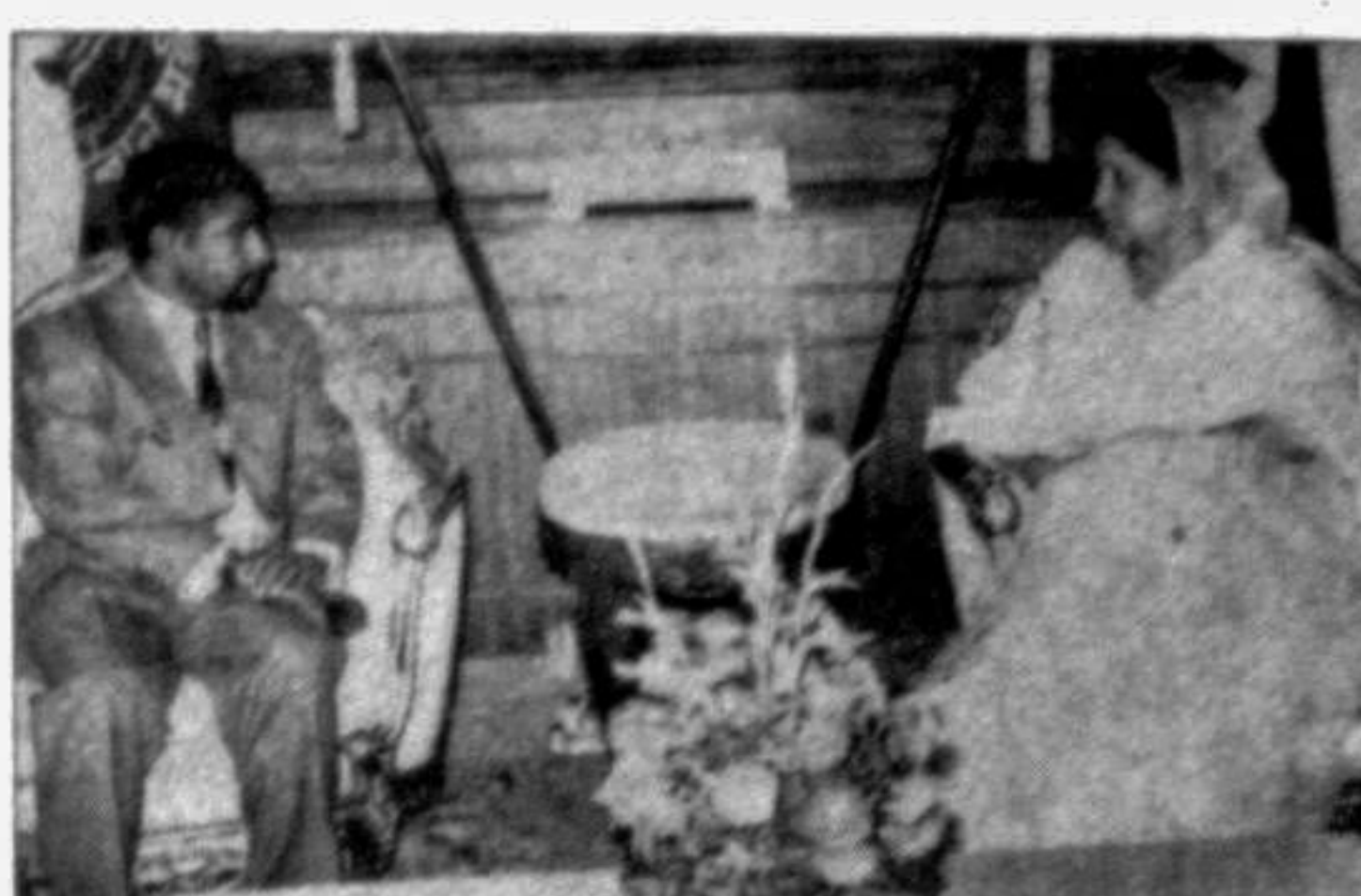
The visiting SAARC Secretary General Ibrahim Hussein Zaki called on Prime Minister Begum Khaleda Zia at her office yesterday.