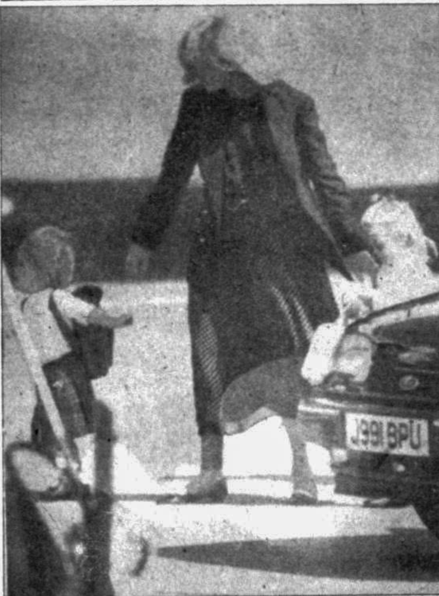
The Duchess of York is seen with her children prior to departing to London from Aberdeen yesterday. According to a Buckingham Palace spokesman she left "as planned" before publication of intimate photographs of the Duchess and her financial advisor, John Bryan, last week.

The two BCL leaders were ordered to general custody at the Dhaka Central Jail.