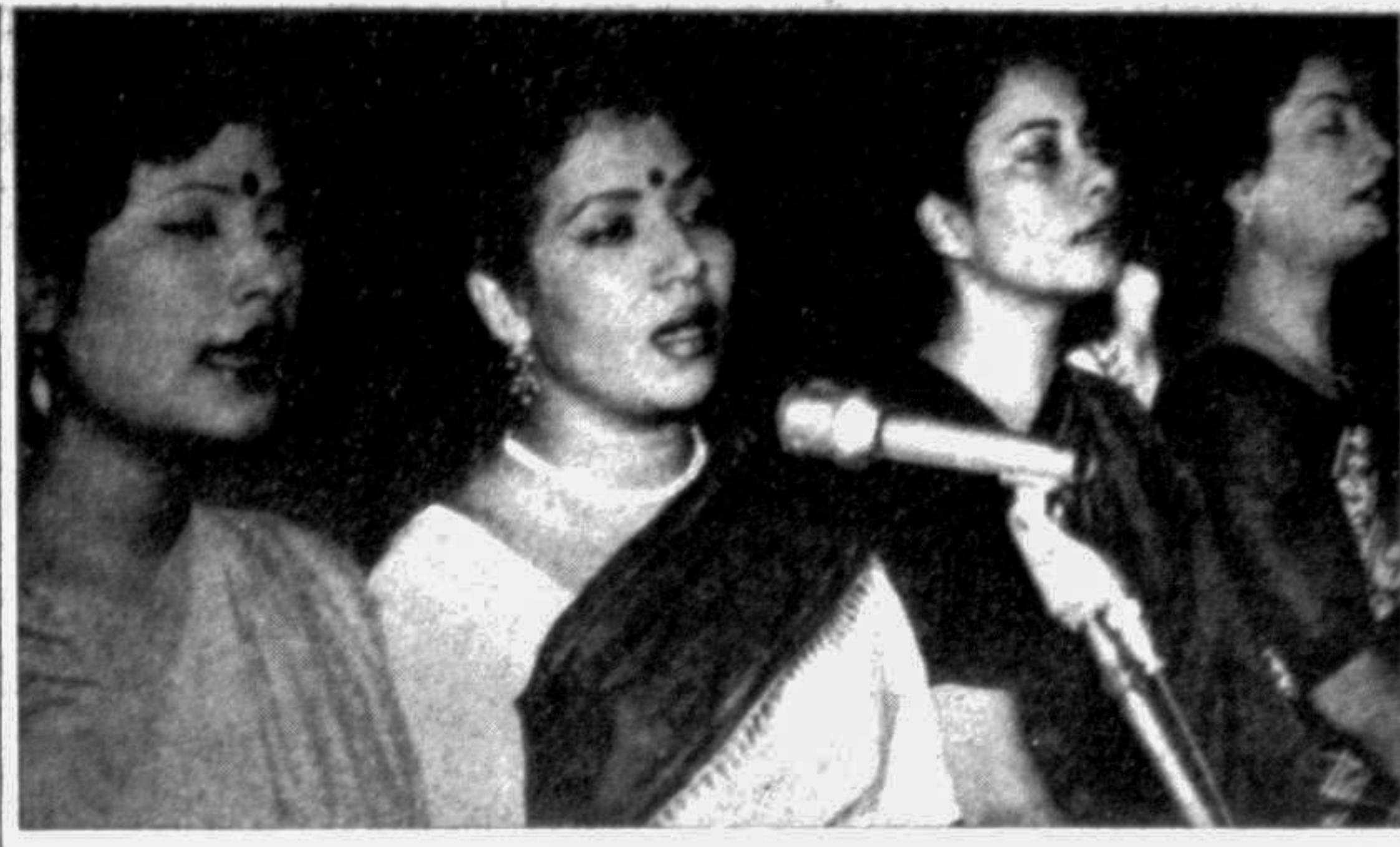
Artistes rendering songs at a function at the Institution of Engineers auditorium yesterday organised by Rabindra Sangeet Shilpi Sangstha.

By Staff Correspondent Light to moderate rain or thundershower is likely at many places over Khulna and Chittagong divisions and a few places over Dhaka and Rajshahi divisions during the next 36 hours commencing 6 pm Sunday. Meteorological office forecast. Day temperature is likely to fall by 1-2 degree Celsius during the period over the country. Light rainfall was recorded in Dhaka, Bogra, Ishordi, Chandpur, Satkhira, Khulna, Bogra, Mymensingh and Bhola yesterday. The sun sets today (Monday) in Dhaka at 6:24 pm and rises tomorrow (Tuesday) at 5:37 am. Temperature and humidity recorded at important cities and towns on Sunday were: Cities/Towns Temperature in degree Celsius Humidity in percentage Max Min 9 am 6 pm Dhaka 30.4 26.5 85 78 Chittagong 32.6 24.9 74 83 Rajshahi 32.0 25.8 86 89 Khulna 32.7 26.2 79 88 Barisal 30.1 25.5 88 87 Cox's Bazar 31.8 25.0 75 85 Sylhet 33.6 23.8 74 63 Mymensingh 32.4 26.3 75 85 Dinajpur 32.0 25.8 88 75