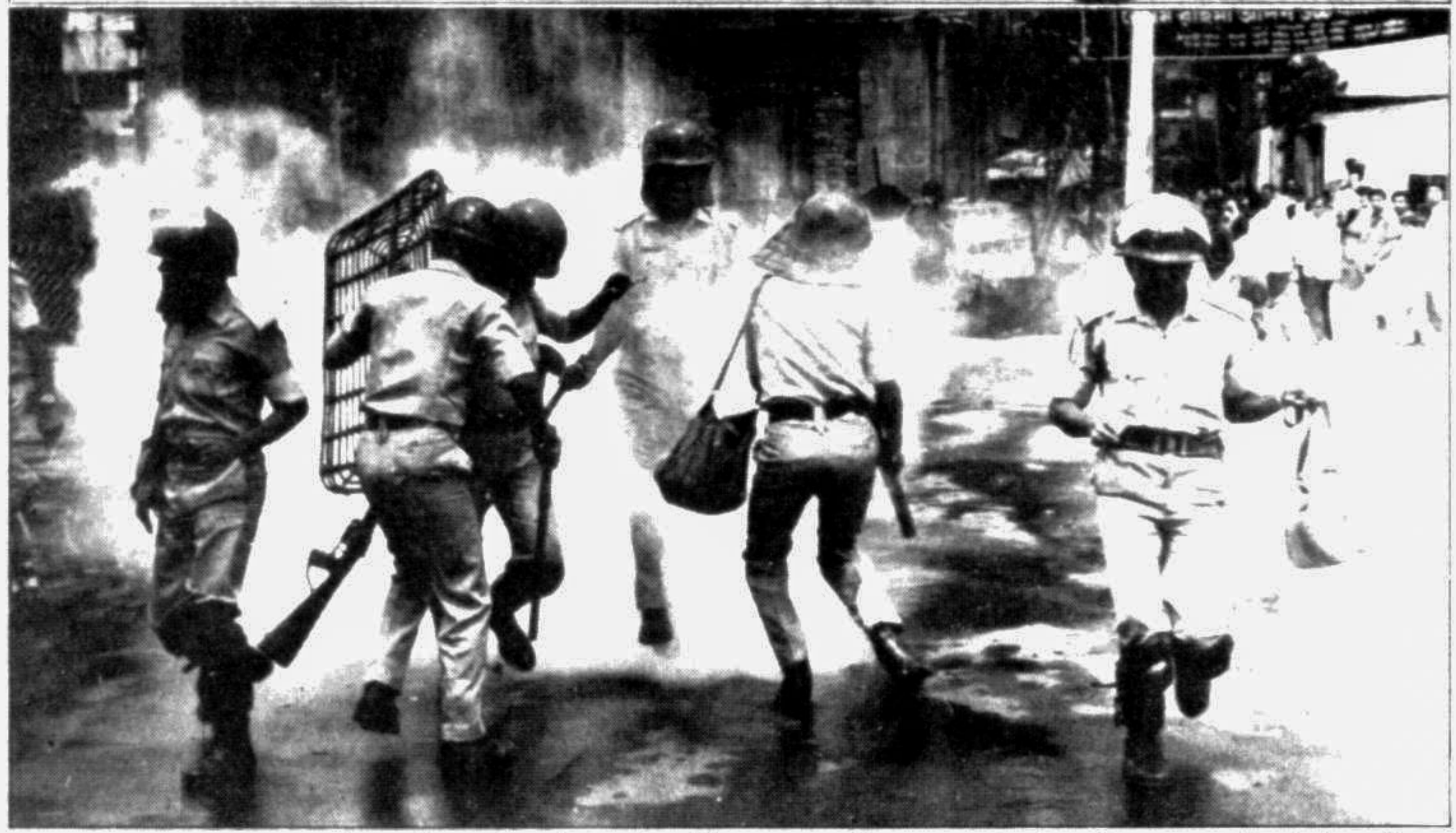
Police baton-charging a picket at Farm Gate during hartal hours yesterday (top) and riot police running for shelter after a cracker exploded near them at Paltan Square (above).