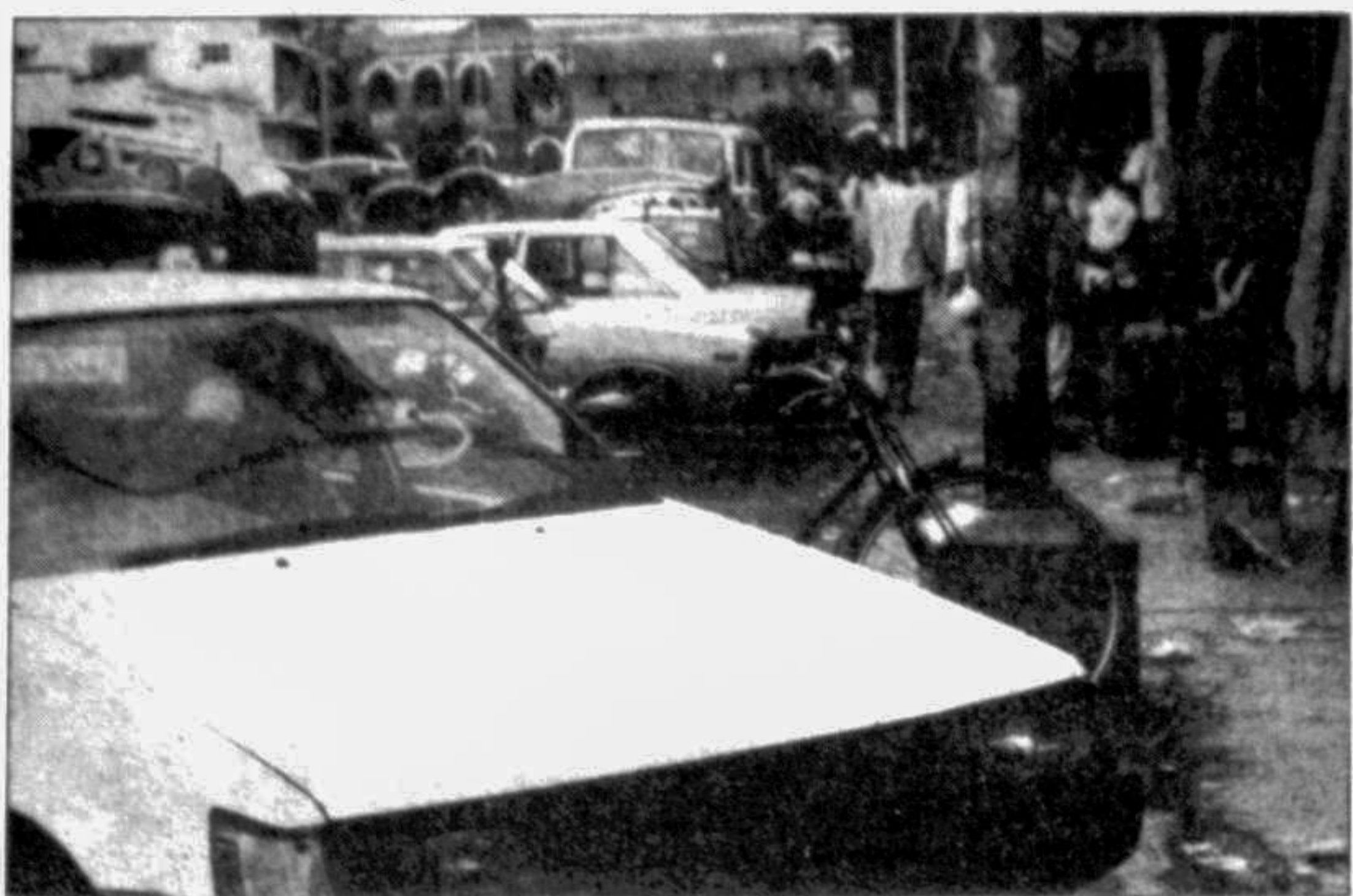
The apparently unpleasing market attracts a lot of people each day