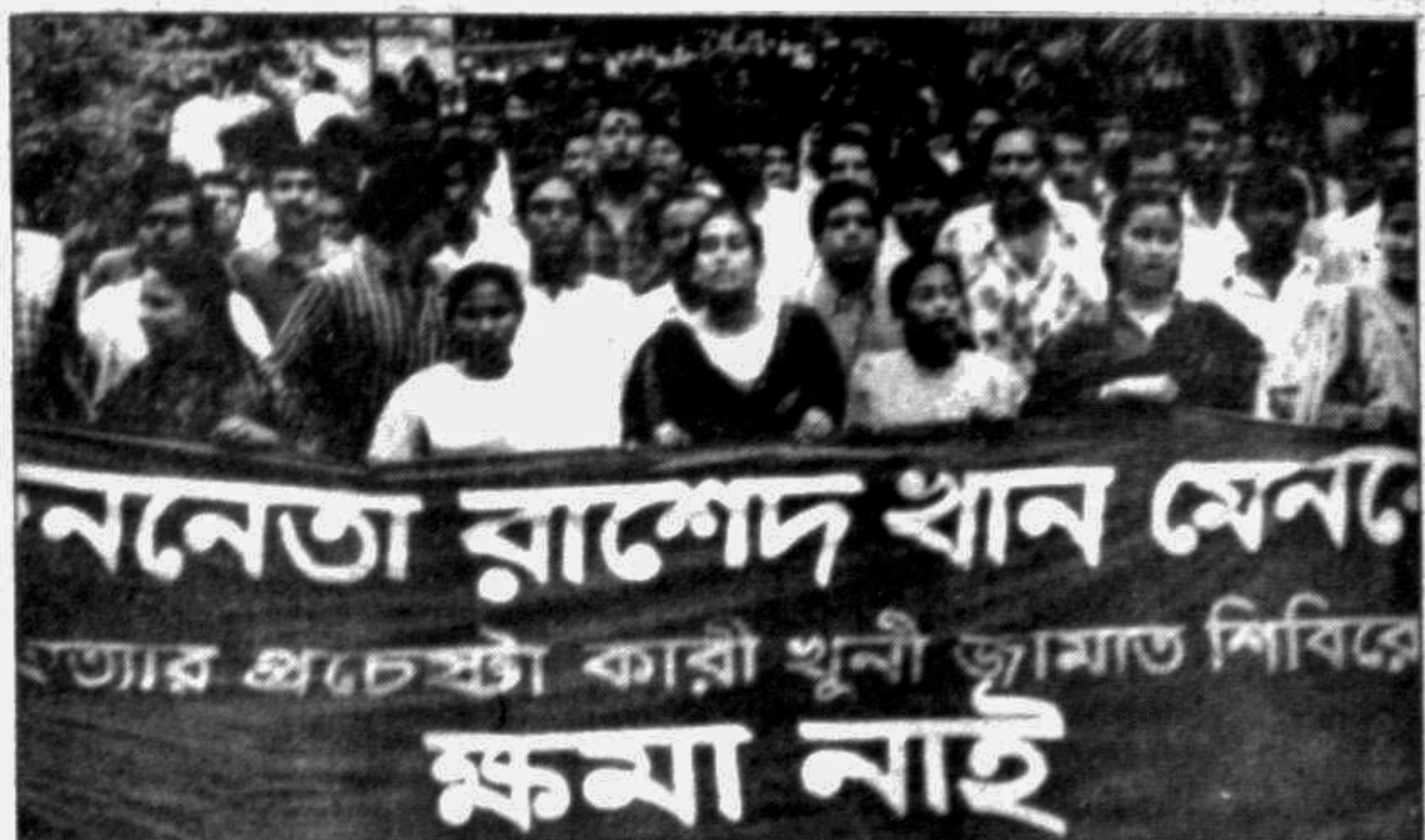
Ganatantrick Chhatra Oikya brought out a procession in the city yesterday protesting attack on Rashed Khan Menon.