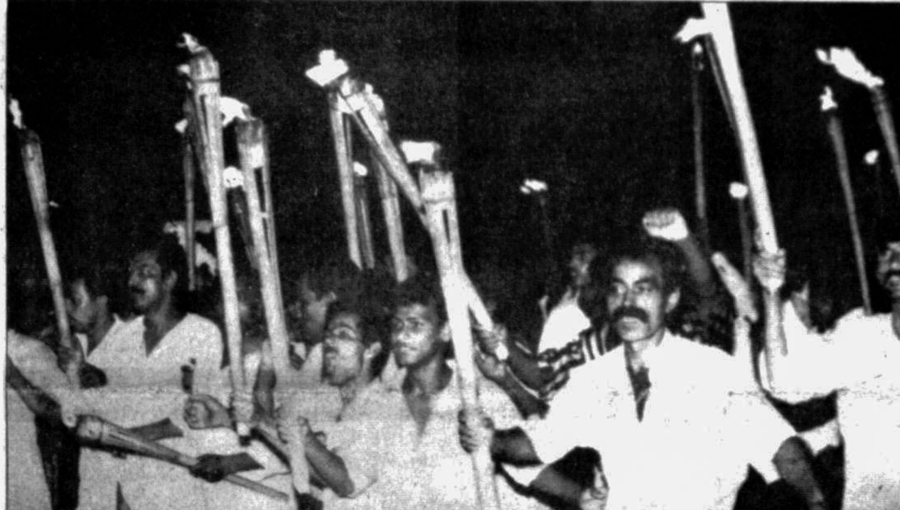
A torch procession was brought out in the city yesterday in support of today's hartal.