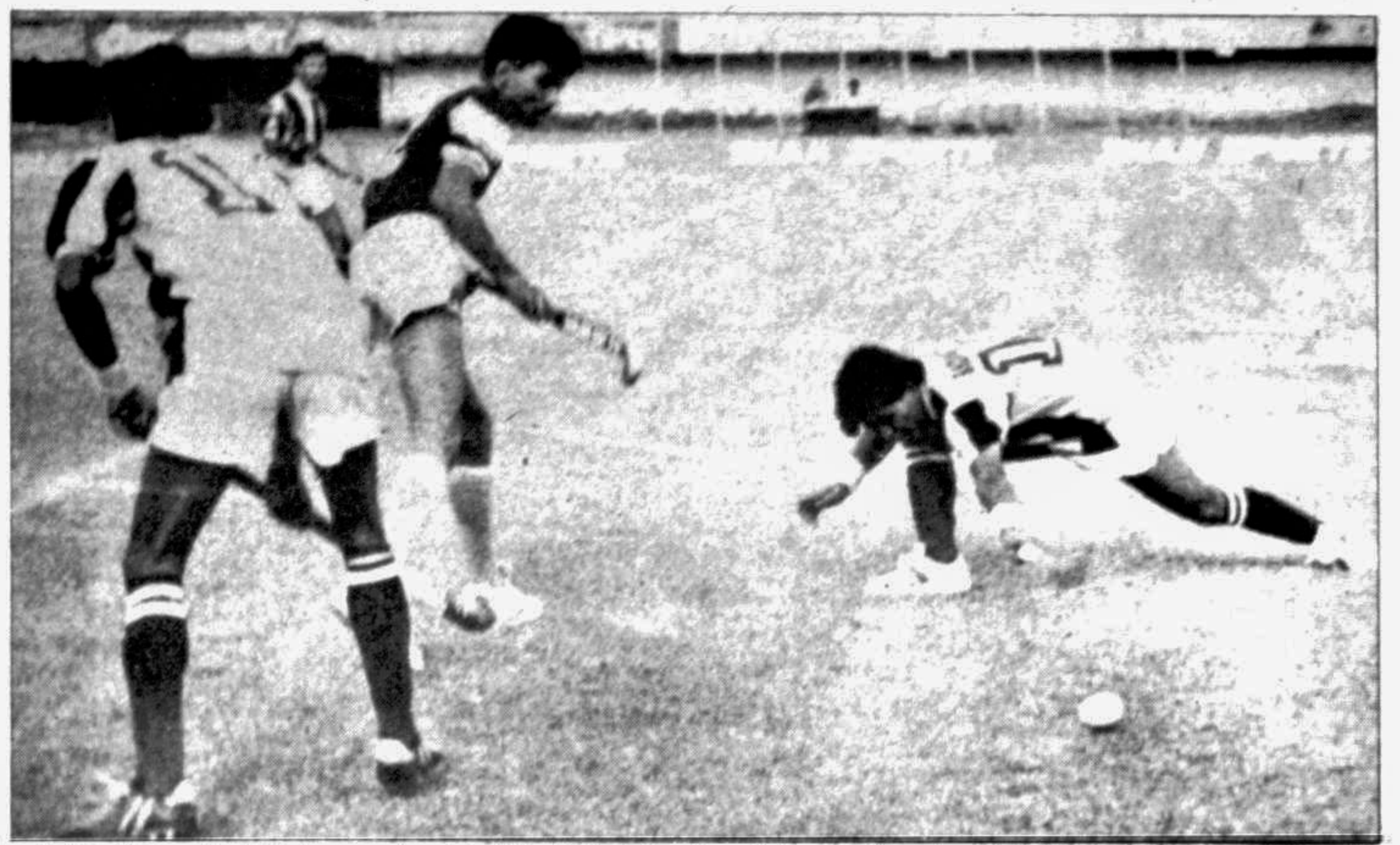
Action from yesterday's inaugural match of the 12th national youth hockey championship between Narayanjan DSA and Noakhali DSA at the Hockey Stadium.