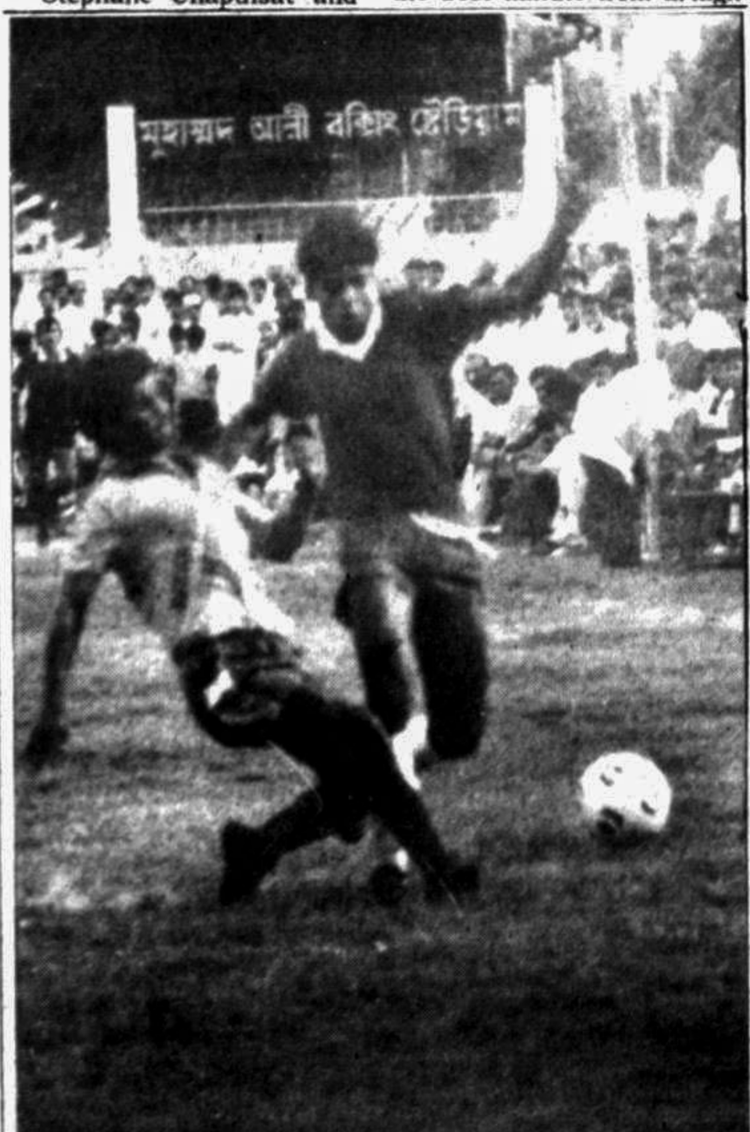
Action from yesterday's Third Division football league opening tie between Little Friends and Kadamtala Sangsad at the Outer Stadium.

cross that gave goalkeeper Mart Poom no change. Veteran Georges Brégy put Switzerland 2-0 with a free kick just wide of the defensive wall in the 29th. The Estonian defence had somehow held the rampaging Swiss at bay before Chapuisat broke the ice. But the Swiss did not have it all their way and goalkeeper Marco Pascolo had to parry frantically a scoring drive from local club Florja's Risto Kallaste who broke through the surprised defence. But the real surprise was that the score was just 2-0 at halftime. Krup, who plays with German champions VfB Stuttgart, beat three defenders in a solo run to make it 3-0 one minute after the interval. It was his 15th goal, a Swiss record, in 21 internationals. His strike proved the final straw for the Estonian defence and they fell apart, allowing the Swiss to take frequent pot shots at Poom. Only good saves by the lanky keeper, who plays with Finnish club Palloseura, kept the score in single figures. Regis Rothenbuehler, playing only his third senior international, scored his first goal for his country in the 53rd minute before Chapuisat hit home again two minutes later after a neat one-two manoeuvre.