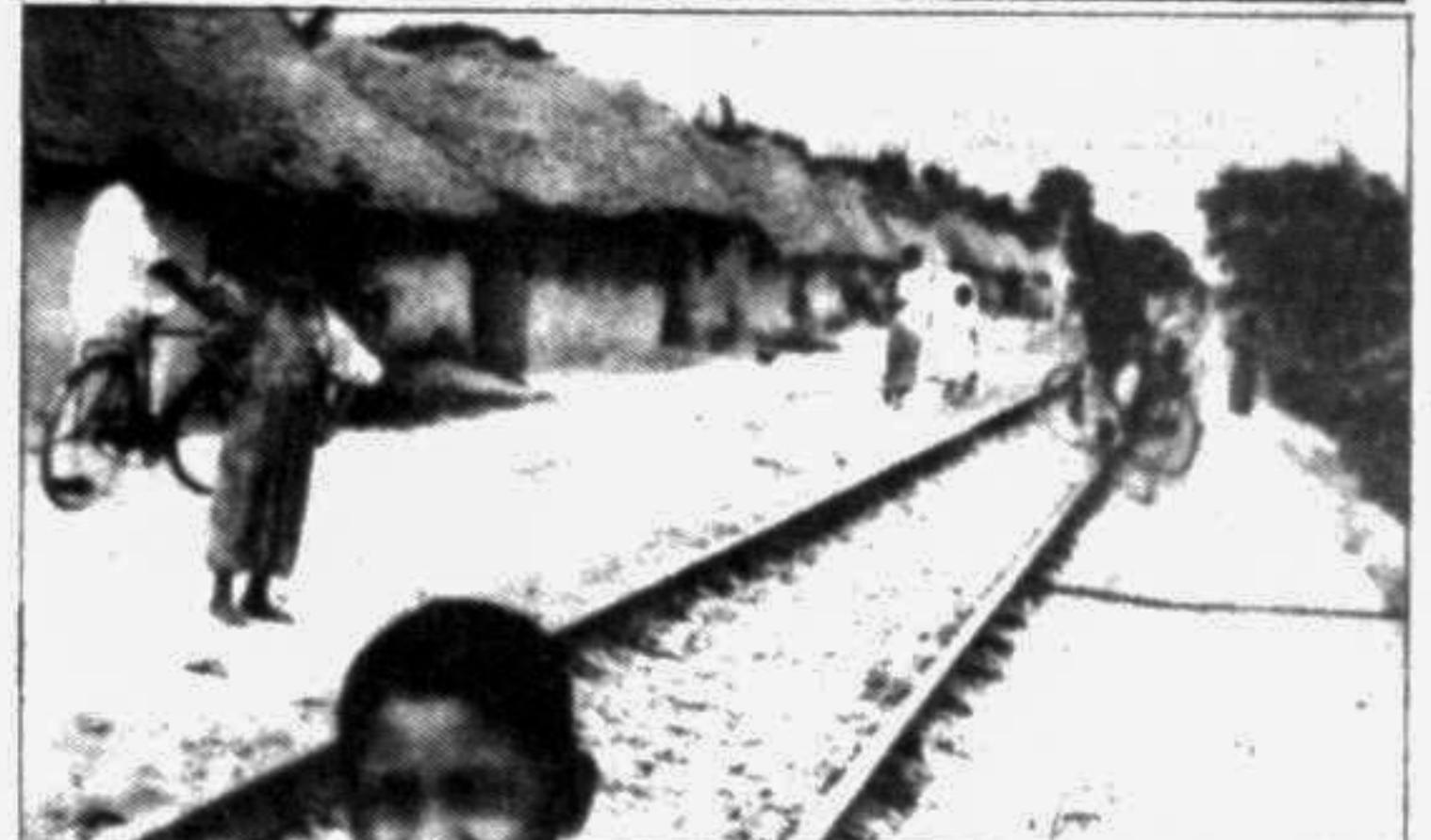
RAJBARI: These houses have been constructed on the lands of the Bangladesh Railway at Kalukhali Station of the Bhatiapara route.