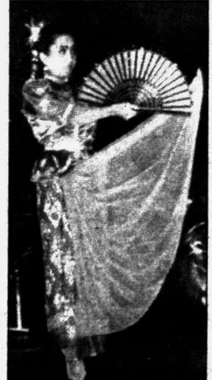
Cultural function on Indonesian Independence Day at Sonargaon Hotel Yesterday.