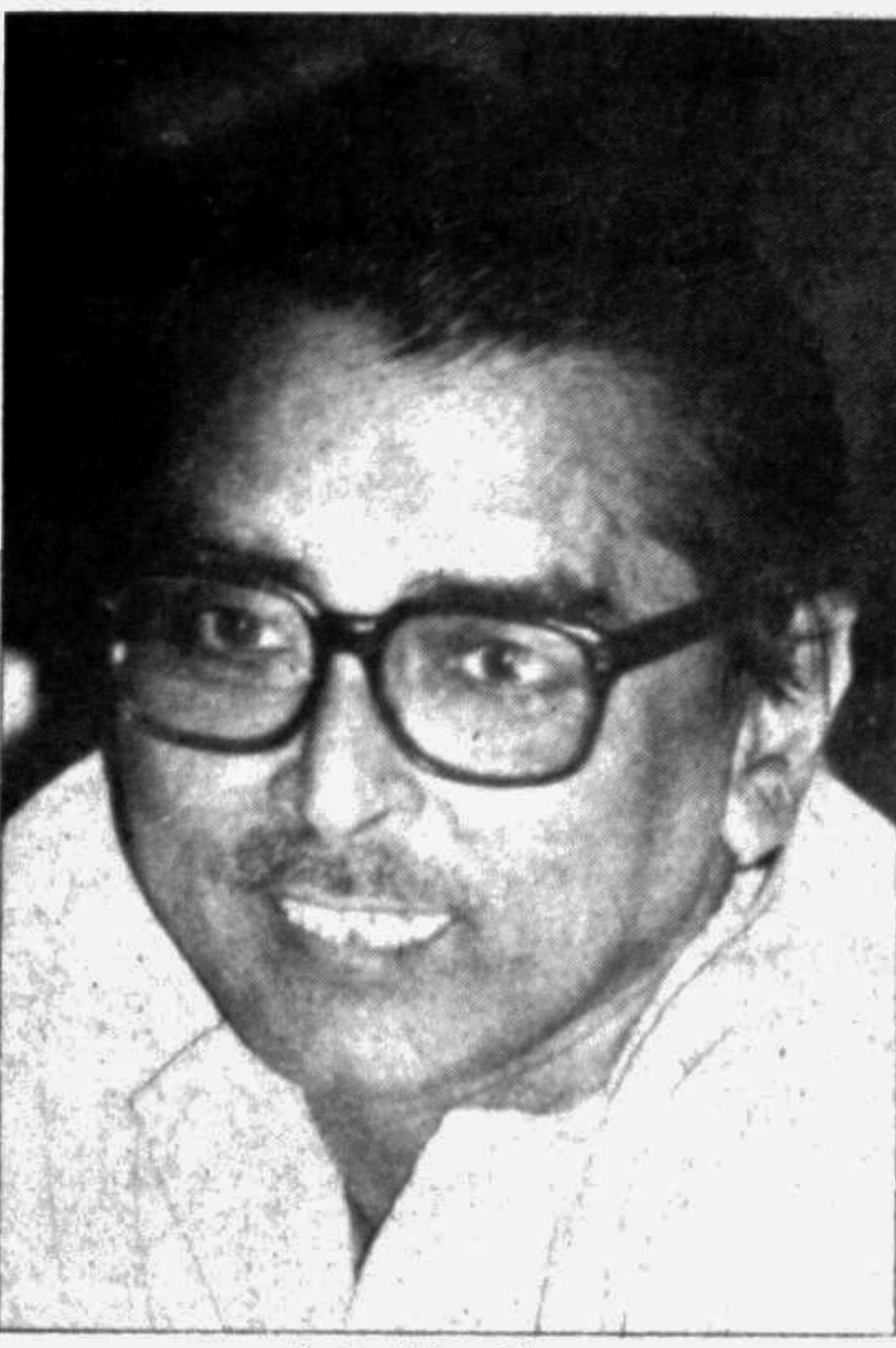
Rashed Khan Menon

By Staff Correspondent Workers Party leader Rashed Khan Menon was shot and seriously injured by unidentified gunmen last night. Menon, with bullet wounds just below his left rib cage, was operated upon at the Combined Military Hospital (CMH) immediately after being admitted there. Attending physicians and surgeons said that the leader was apparently out of danger. Menon was talking to a group of party leaders and workers at 8:35 pm in front of his party office at Topkhana Road after attending a meeting there when the assailants, numbering three, came up to him and fired point blank, eyewitnesses said. A bleeding Menon fell to the ground grabbing his chest and crying out, "In the chest, in the chest." The witnesses said that before the shooting, the assailants, armed with cut rifles, positioned themselves in front of a tea shop after threatening the shop owner of dire consequences if he tried to close his shop. Immediately after the shooting, the assailants escaped through a lane behind the National Awami Party office shouting "We will not let any son of a bitch live and this is the first one", the witnesses said. Seeing Menon in a pool of blood, his driver, waiting to drive him home ran back to the party office to inform his colleagues about the incident while the other workers carried him to his jeep rushed him to the Dhaka Medical College Hospital, witnesses said. Sources at the CMH said that two bullets had hit See Page 12 Col 1