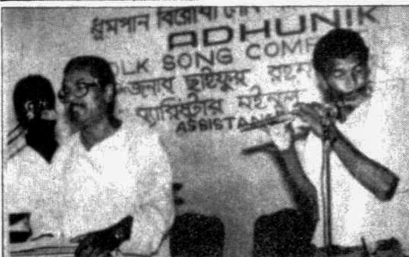
Folksong competition-92, an anti-smoking programme of ADHUNIK held at Jatiya Press Club auditorium yesterday.