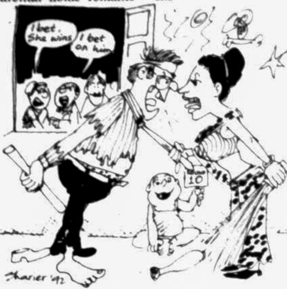
The woman says, 'I bet on him'.

It is a pity that we have no marriage counsellors in Dhaka, as they do in other cosmopolitan cities. Simply having agony columns in newspapers and magazines, as one sees it, is not enough. Not that all marriages have a catastrophic end!