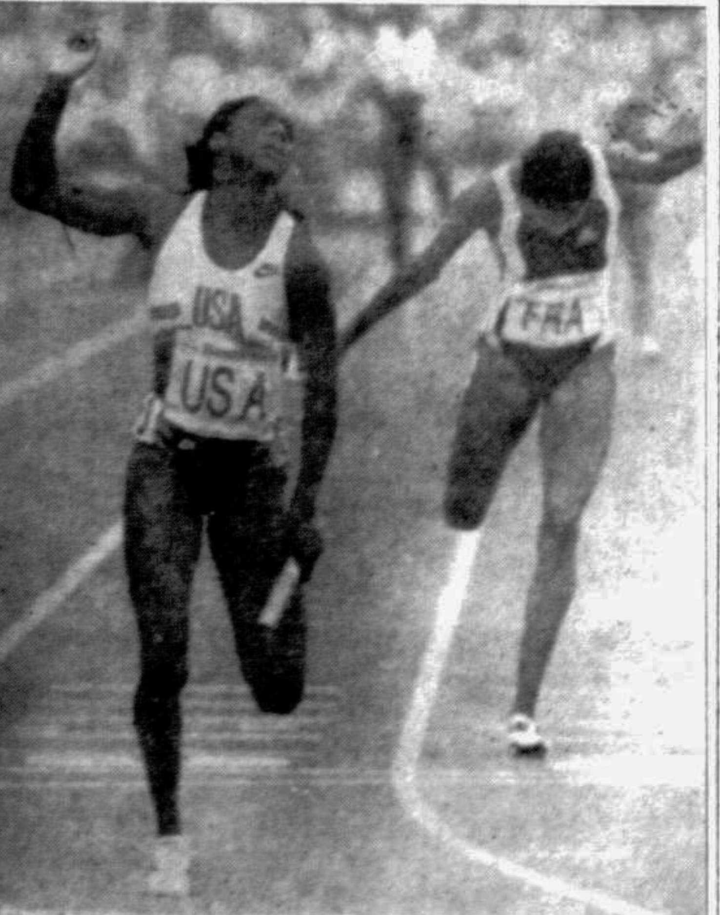
American Gwen Torrence crosses the finish line during the anchor leg of the women's 4x100m relay final on Saturday. France's Marie Jose-Perec is also seen in the picture. The Americans won the gold in 42.11 secs while France finished fourth.

Sarunas Marciulionis had 29 points and Arvidas Sabonis added 28 and Lithuania beat the Unified Team 82-78 for the bronze medal.