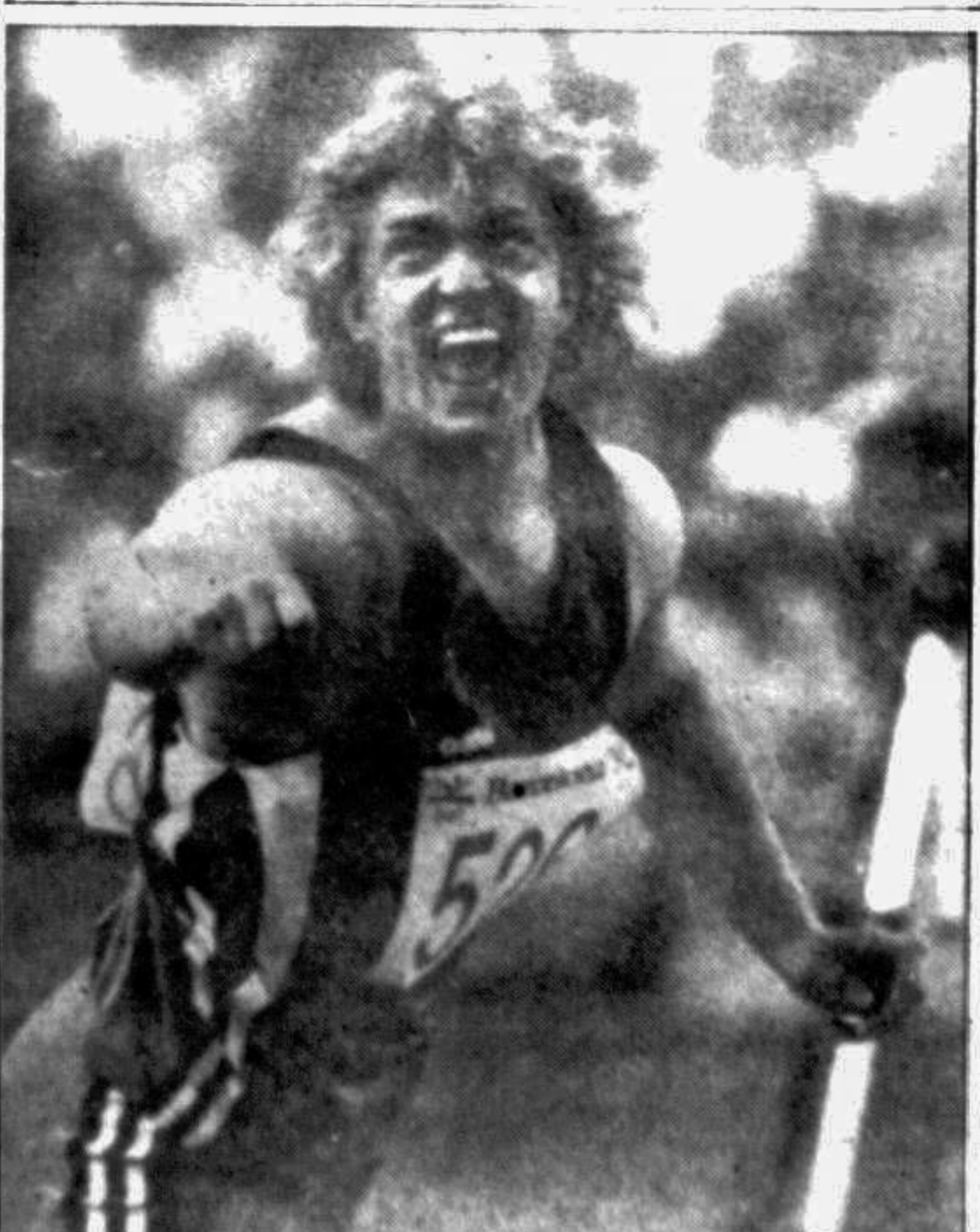
Svetlana Krivneva of the CIS shouts as she throws the shot putt to a distance of 21.06m to clinch the women's gold medal in Barcelona Friday.