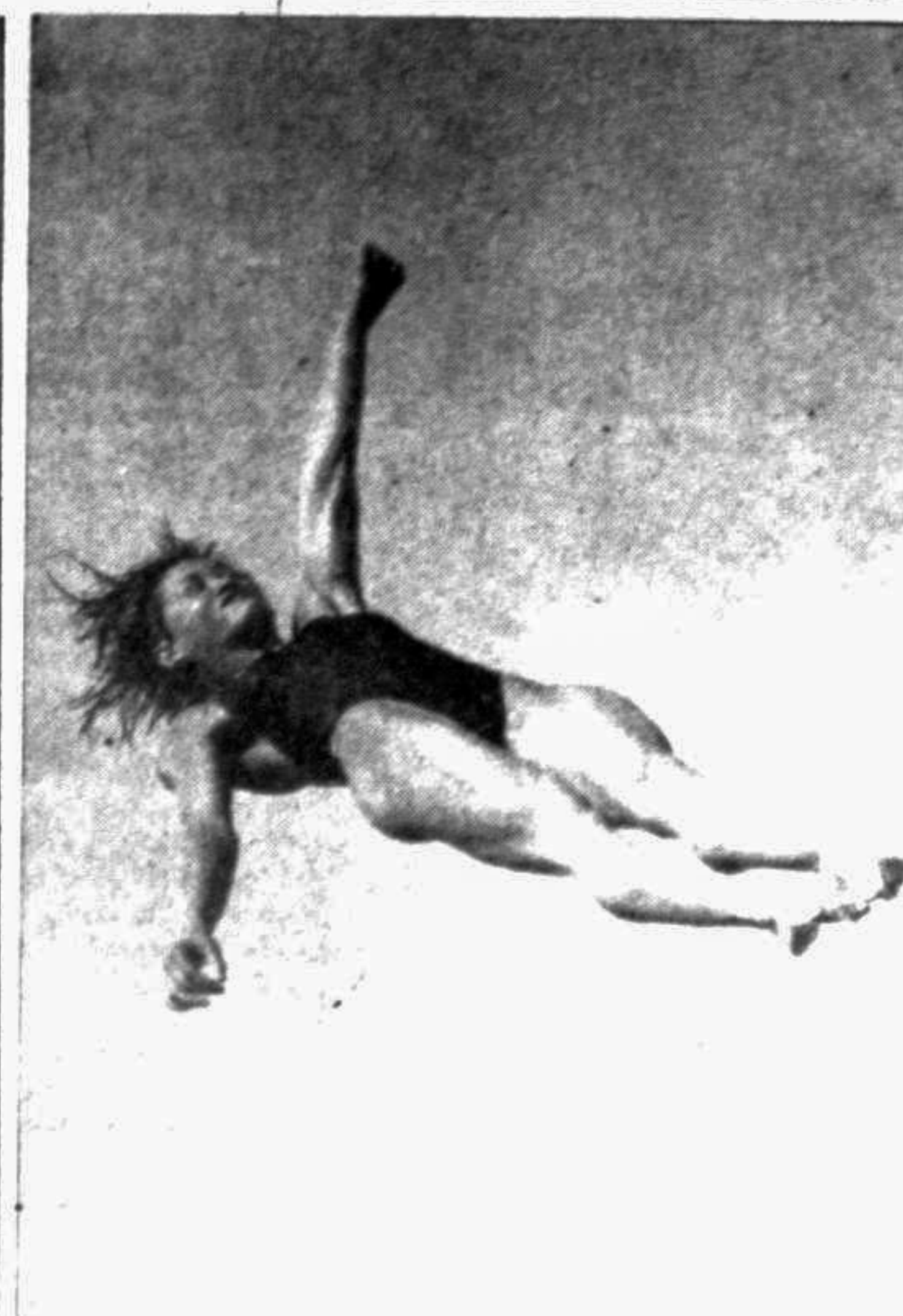
GAO MIN... 3-meter springboard queen

After the eight days of shooting at one of the world's most high-tech ranges, the CIS dominated the medals table