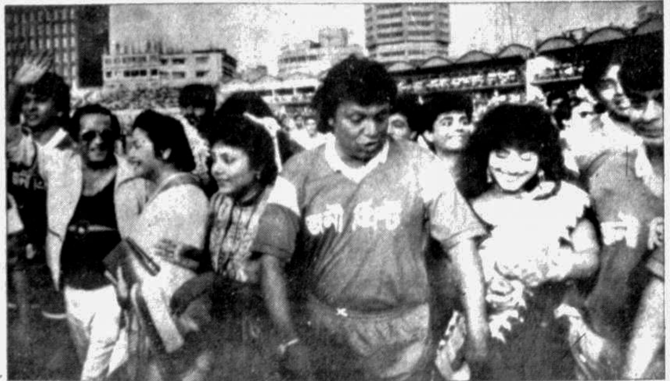
An exhibition match was played between the Film Artistes Association and Football Players Welfare Association at the National Stadium yesterday to raise fund for the distressed footballers and film-artists. The match ended in a 2-2 draw.

SARAJEVO, July 31: Serb forces and Bosnian territorial units fought a major battle near a maternity hospital and zoo in downtown Sarajevo on Friday. Doctors said at least eight people were killed, reports AP. Fighting erupted before dawn in the Poljine section, in the northern part of the downtown area and continued into the afternoon. The battle came in an upsurge of fighting around the Bosnian capital that forced temporary closure of the airport, its lifeline to the outside world. Authorities issued a warning to residents, and central Sarajevo was deserted. Fifty orphans who were to be evacuated from Sarajevo on Friday were stranded by the fighting. The increased fighting followed several days of talks in London among representatives of the Muslim-led government, and Bosnia's Serbs and Croats on a political settlement to the conflict that has killed at least 7,500 people since spring. Little progress was reported. Talks among the same representatives two weeks ago resulted in a cease-fire that lasted only a matter of hours before it collapsed. Bosnian territorial officials said the infantry and artillery battle began with a Serb assault on the neighborhood. But territorial forces appeared to be pushing the Serbs back.