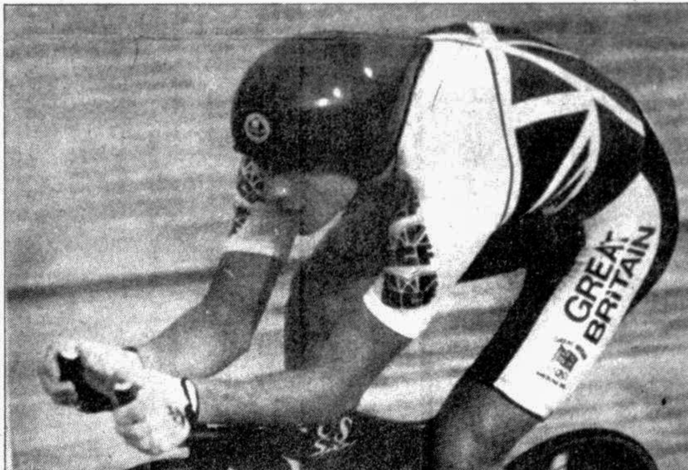
Cyclist Christopher Boardman of Great Britain rides to take the gold medal in the men's individual pursuit in Barcelona Wednesday.

Qualifying continues Thursday with five medal races set for Friday, in the men's and women's sprint, the women's individual pursuit, and the men's team pursuit and points race.