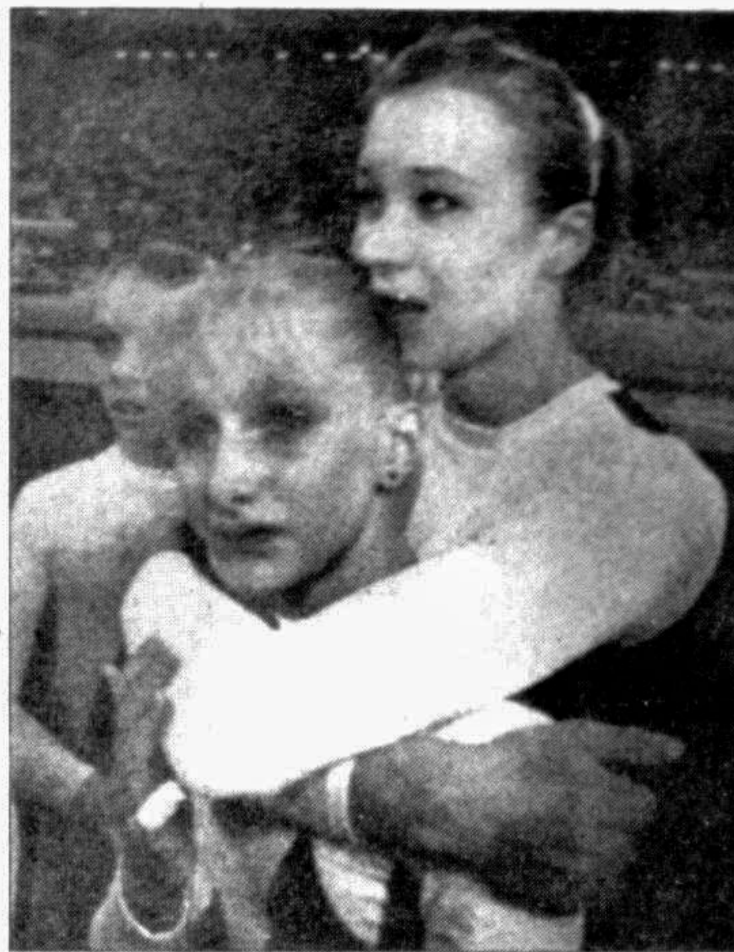
Unified Team's Svetlana Boguinskaya (L) hugs her teammate Tatiana Goutsou after winning the women's gymnastics team gold in Barcelona Tuesday.