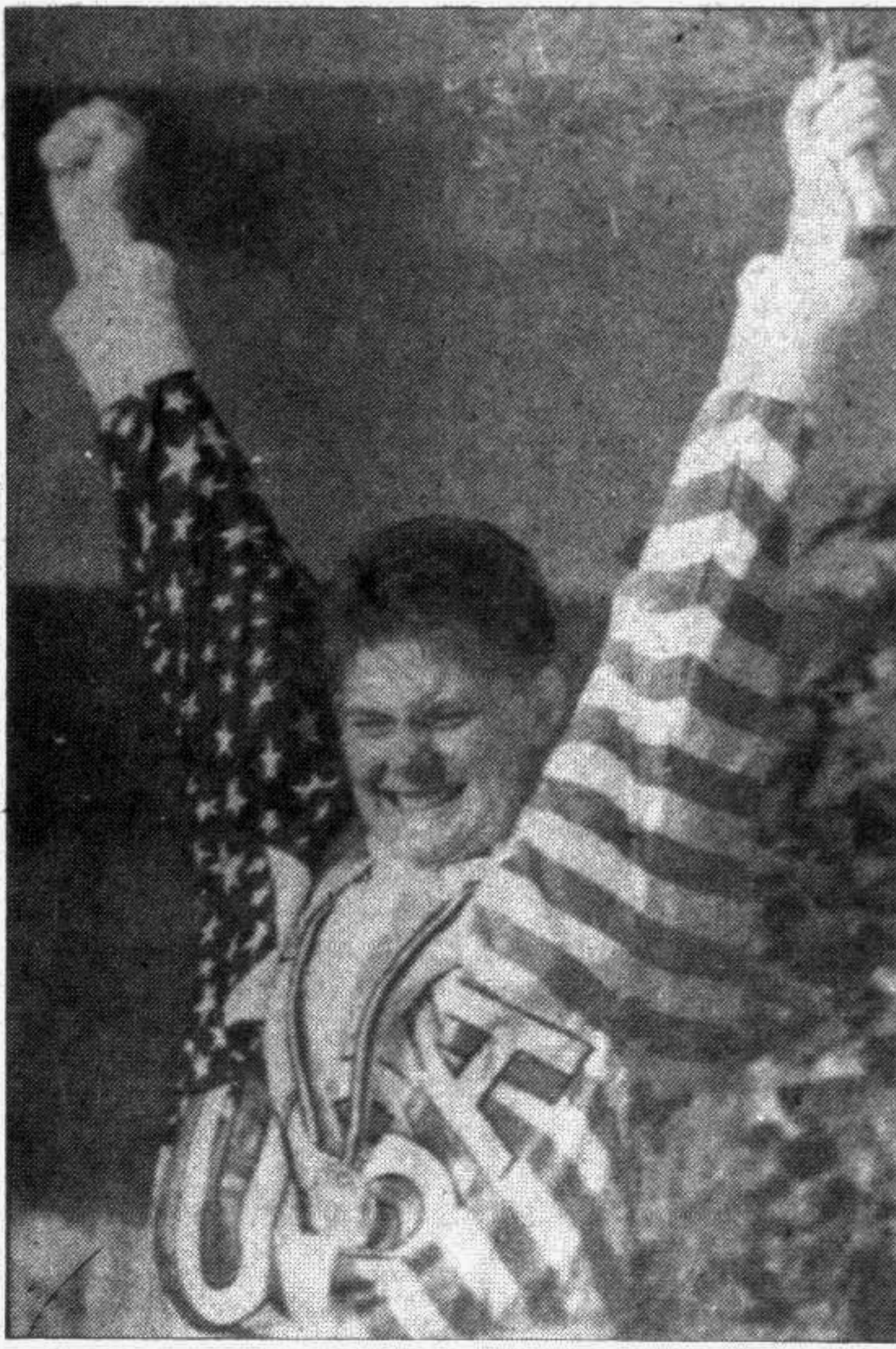
Women's 200m freestyle swimming champion Nicole Haislett of the United States celebrates on the podium in Barcelona Monday.

In Valencia, the Spain dominated Egypt, controlling 64 per cent of the possession and corners to the North Africans two.