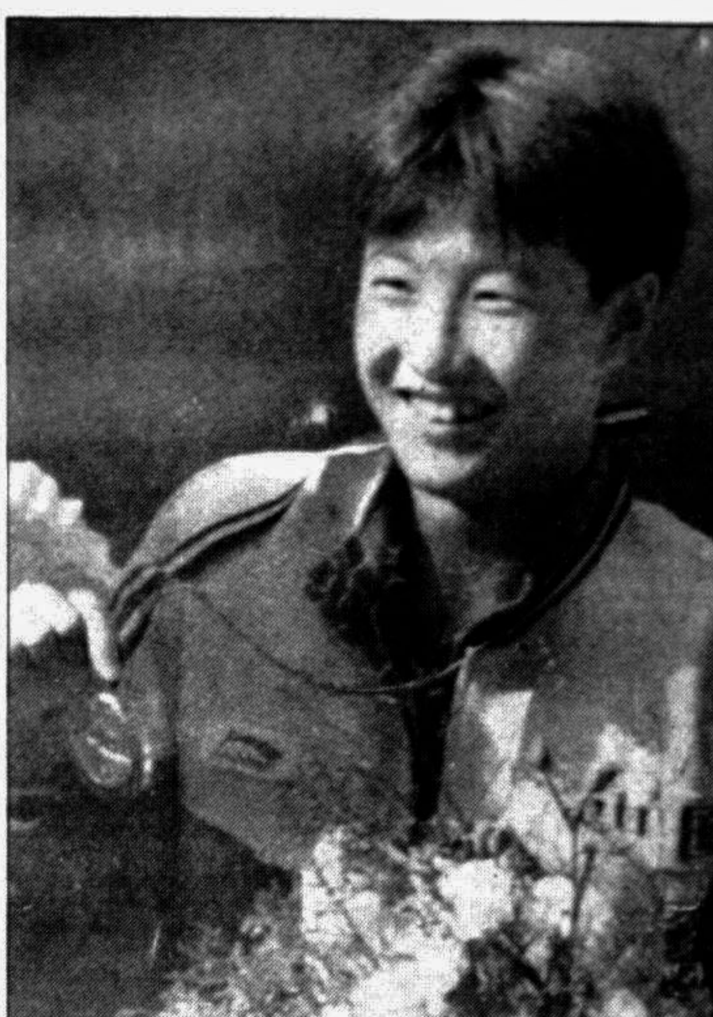
Chinese super diver Fu Mingxia, 13, happily displays the gold medal after winning the women's 10m platform final in Barcelona Monday.