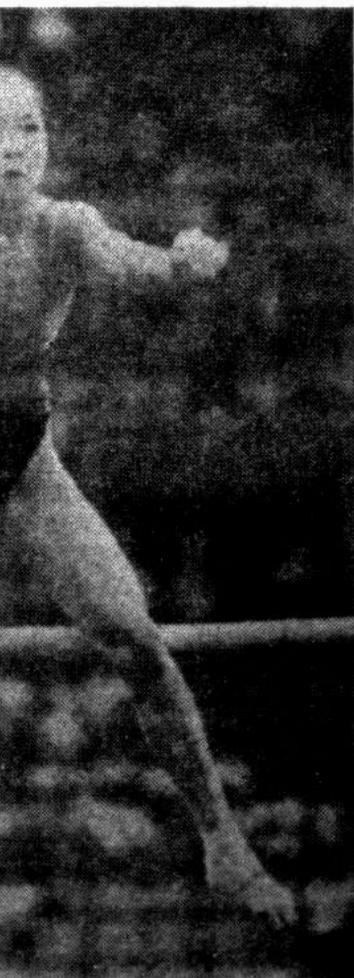
He Xuemei of China performs her uneven bars routine wearing one of China's new Olympic uniforms. The team was penalised 0.2 points for what the International Gymnastics Federation deemed improper dress, showing too much of the thighs.

Her highs were a 9.975 on the floor and a 9.925 on the uneven bars. She added a 9.875 on the balance beam, where she opened the night with a deep breath and a perfect dismount.