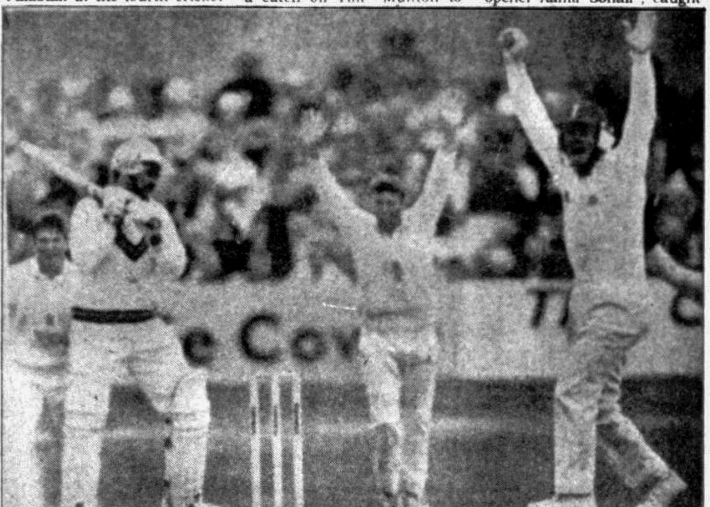
England's Robin Smith (R) raises his hands after catching Pakistan batsman Javed Miandad for six off the bowling of Derek Pringle during the first day's play of the fourth Test between England and Pakistan at Headingley on July 23.

Resuming at 165 for eight, Malik and Mushtaq Ahmed brought the score to 192 as improved weather conditions made the batsmen's job easier. But Mushtaq eventually went for 11, after batting for 90 minutes. Last man Aqib Javed nicked a catch off Tim Munton to Ahmed six not out. They were a meagre 68 for four when a second rain interruption brought the players off for an early tea. New cap Neil Mallender took three for 55 on his first day in Test cricket, starting with the prize wicket of opener Amir Sohail, caught