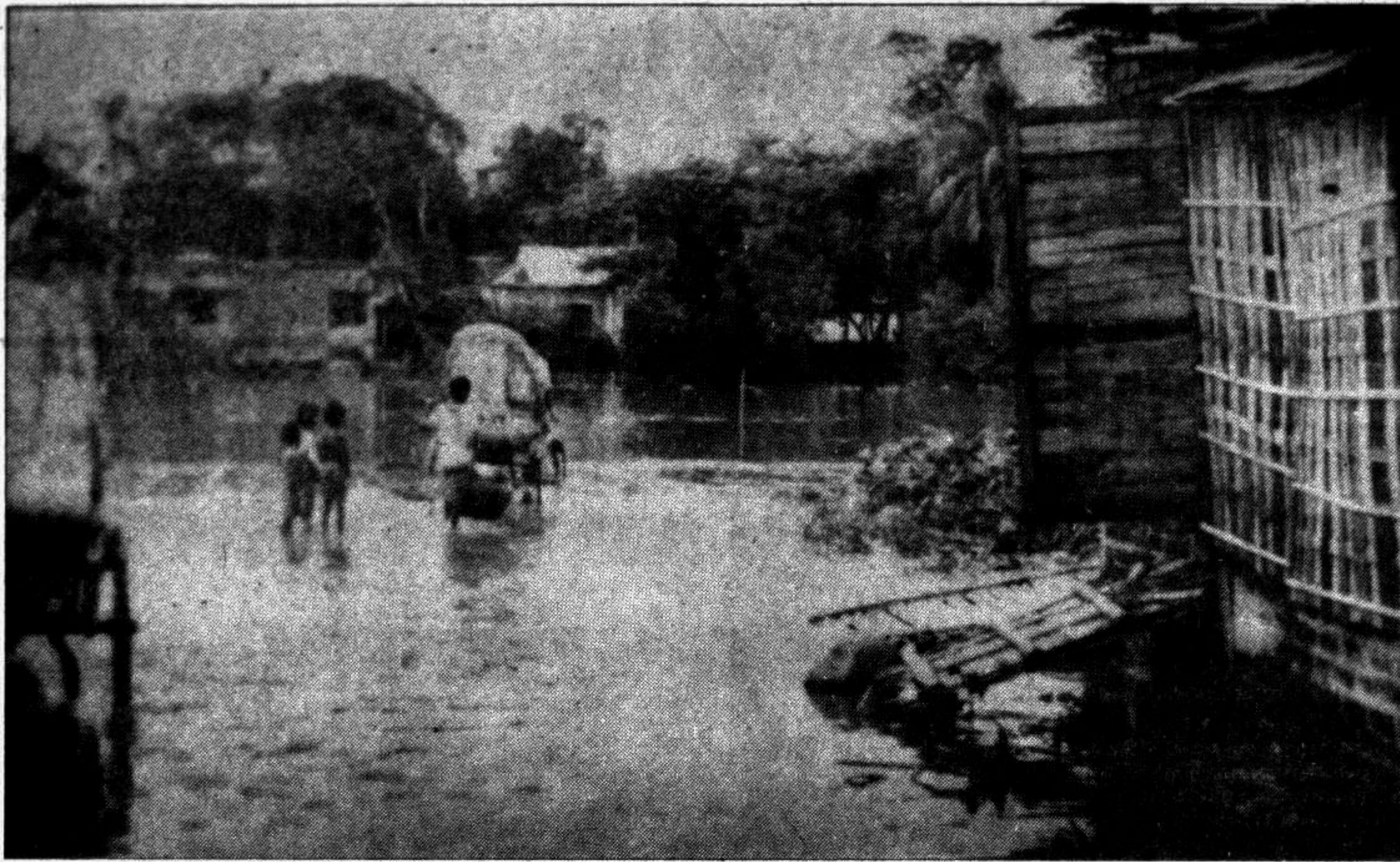
RANGPUR: The low-lying areas of the district town go under water after rainfall due to absence of proper drainage system.