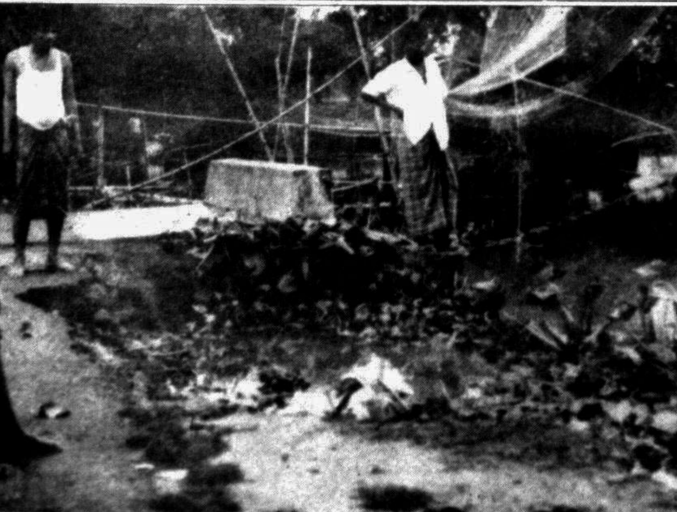
SYLHET: A culvert, newly constructed few days back on Chalibandar-Chhararpar Road of the town recently damaged for faulty construction.