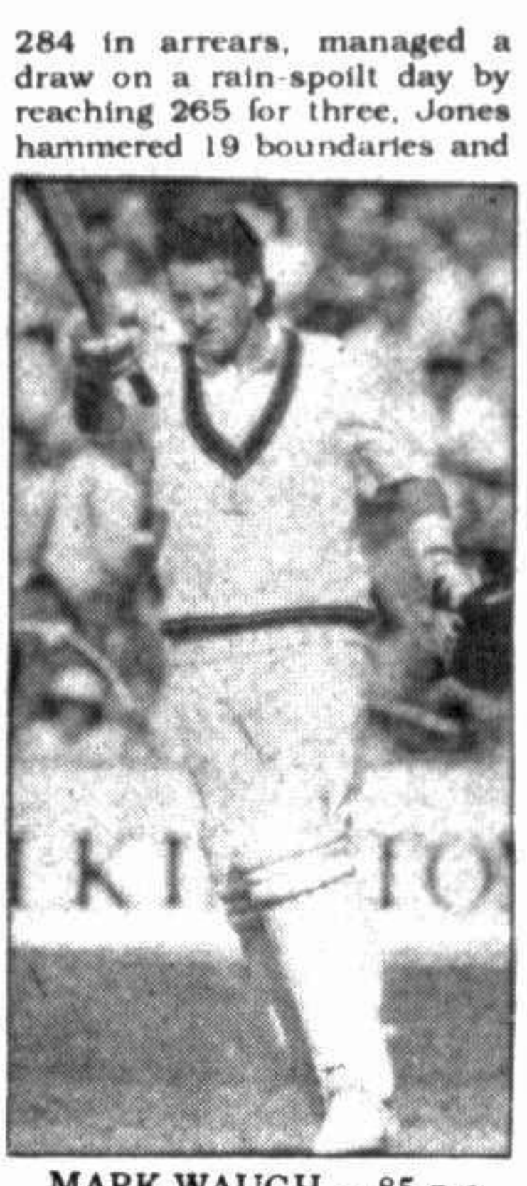
MARK WAUGH ... 85 no three sixes in his 204 minute innings.